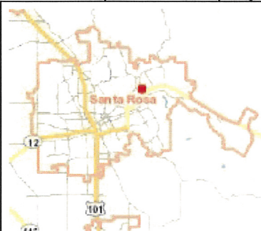
Project site for Mission Village Condominiums