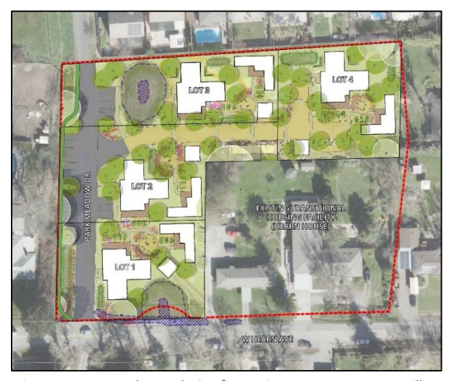
Figure 5: Proposed Parcels Configuration- Hearn Veterans Village

Access to the project site is proposed at the southwest corner via an existing driveway and a new 24-foot private access easement which will