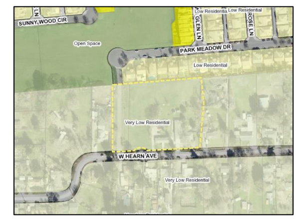
Figure 6: Land Use map