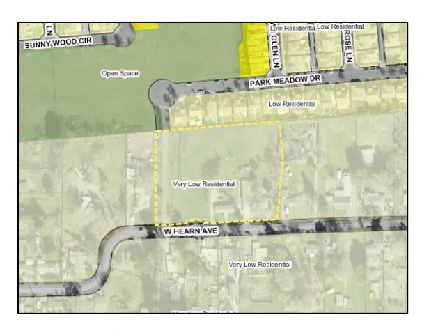
Figure 6: Land Use map

The site is zoned Rural Residential and is within the Rural Heritage Combining District (RR-20-RH). The site is currently undeveloped and predominantly contains