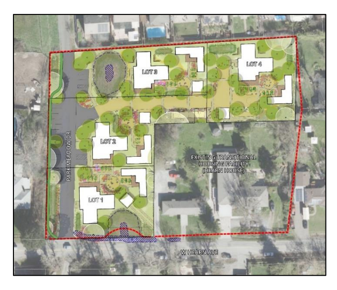
Figure 5: Proposed Parcels Configuration- Hearn Veterans Village

The Zoning Code defines Supportive Housing as: "Housing that is occupied by a target population, such as low income persons with mental disabilities, substance abuse or chronic health conditions. Services typically include assistance designed to meet the needs of the target population in retaining housing, living and working in the community, and/or improving health and may include case management, mental health treatment, and life skills. There is typically no limit on the length of stay, and the housing is linked to on-site or off-site services."