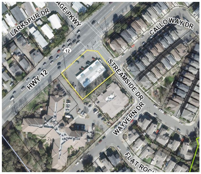
Figure 1: Location of Proposed Project Site

The Jane Dispensary (Project) proposes to operate a medical and adult use Cannabis dispensary with delivery within a 1,997-sqaure-foot space within an existing 4,776-square-foot multi-tenant commercial building. The applicant proposes to operate the retail dispensary between the hours of 9:00 am and 9:00 pm, seven days a week, consistent with Zoning Code Section 20-46.080(F)(4). The applicant proposes to limit all commercial deliveries to the hours of 9:00 am to 5:00 pm, Monday through Friday.