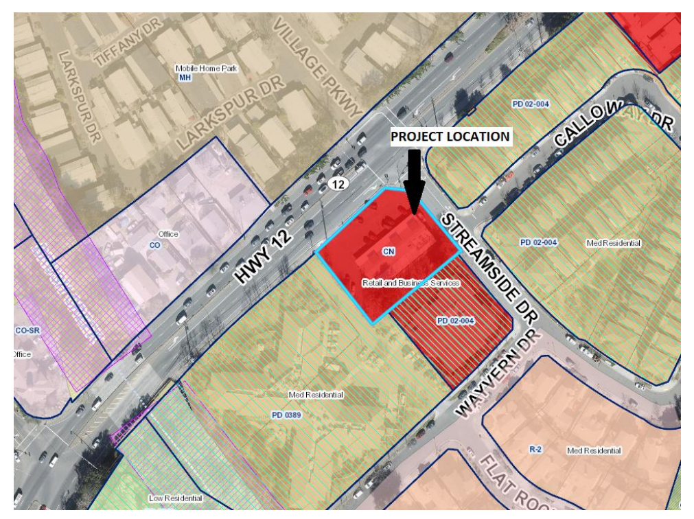
Figure 2: Zoning District Map of Proposed Project Site

North: MH (Mobile Home Park) South: PD 02-004 (Planned Development) East: PD 02-004 (Planned Development) West: PD 0389 (Planned Development)