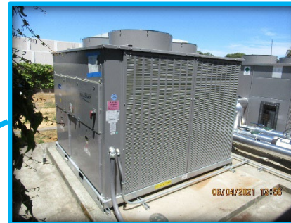
(2) 50-ton Chillers @ Admin Bldg.