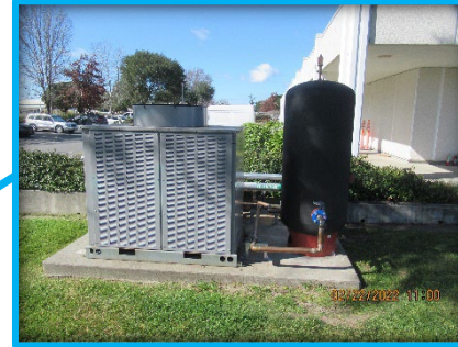
(1) 15-ton Chiller @ Annex Bldg.