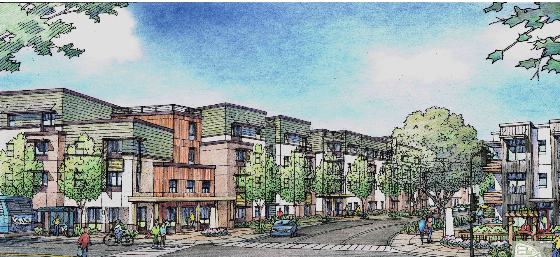
Main entry to the community from Mendocino Avenue