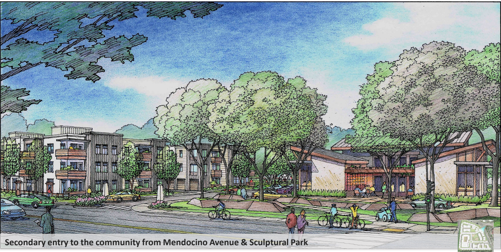
Secondary entry to the community from Mendocino Avenue & Sculptural Park