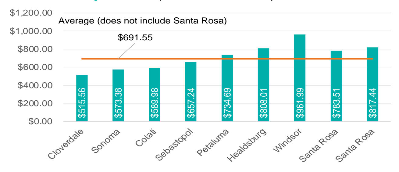
Figure 2: 4CY 1 time per week Commercial Rate Comparison*

APPROVE A RECOLOGY REFUSE RATE INCREASE, EFFECTIVE JANUARY 1, 2024 AND AUTHORIZE CITY MANAGER TO NEGOTIATE AND APPROVE A FIFTH AMENDMENT TO THE COLLECTION SERVICE AGREEMENT BETWEEN CITY OF SANTA ROSA AND RECOLOGY SANTA ROSA PAGE 8 OF 9