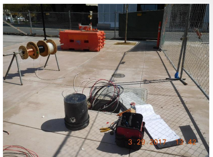
In Ground Boxes