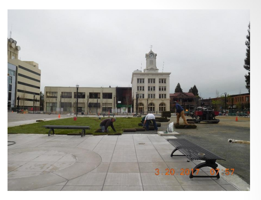
Benches and Bike Racks