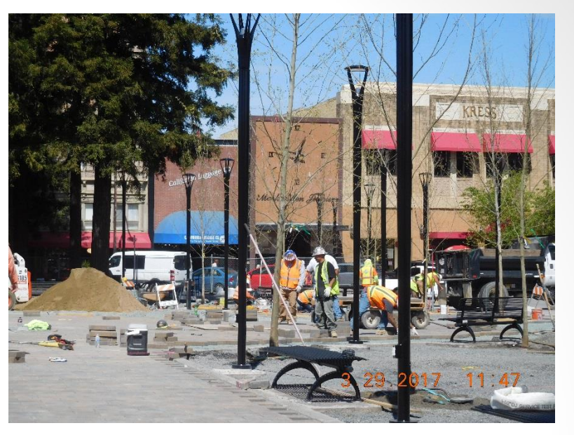
North side pavers