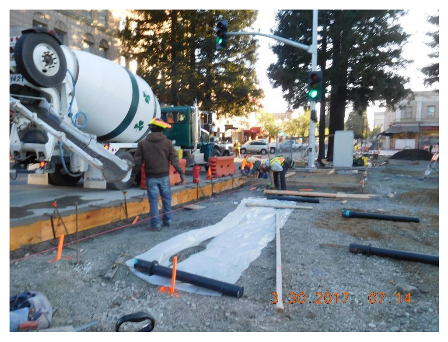
North side paving