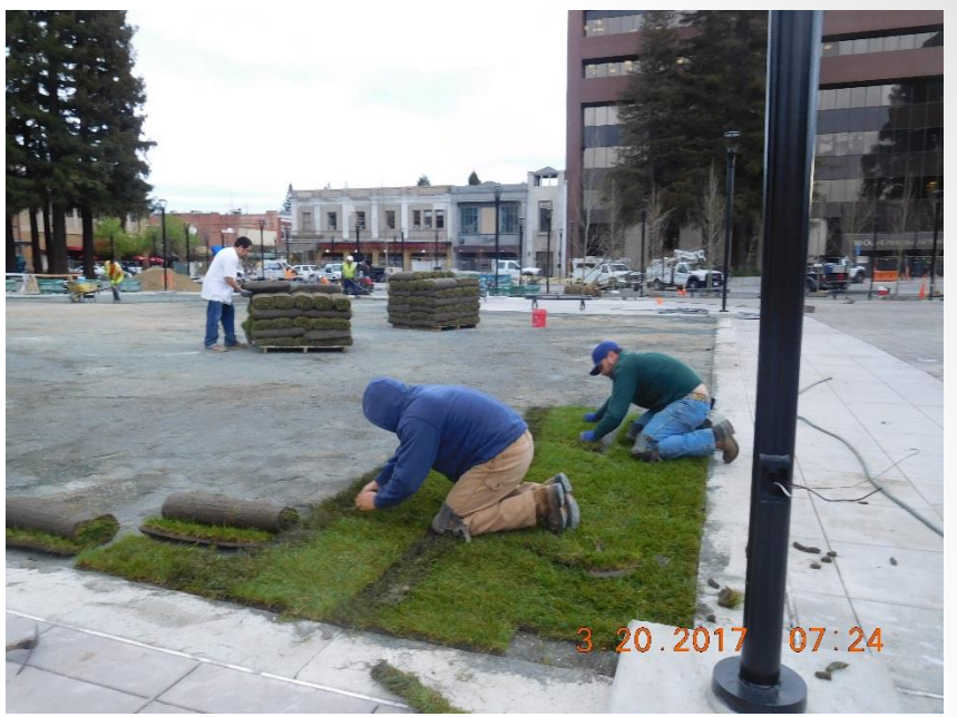
Unrolling the Sod