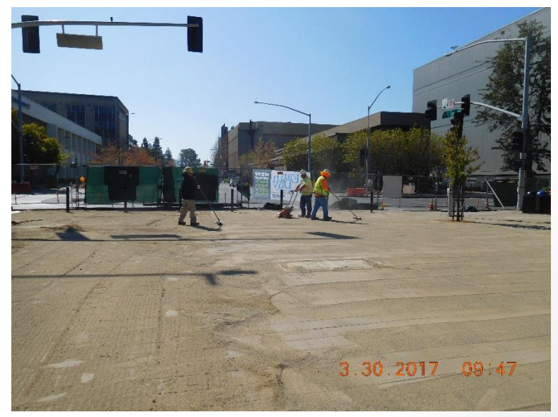
Tamping on South side