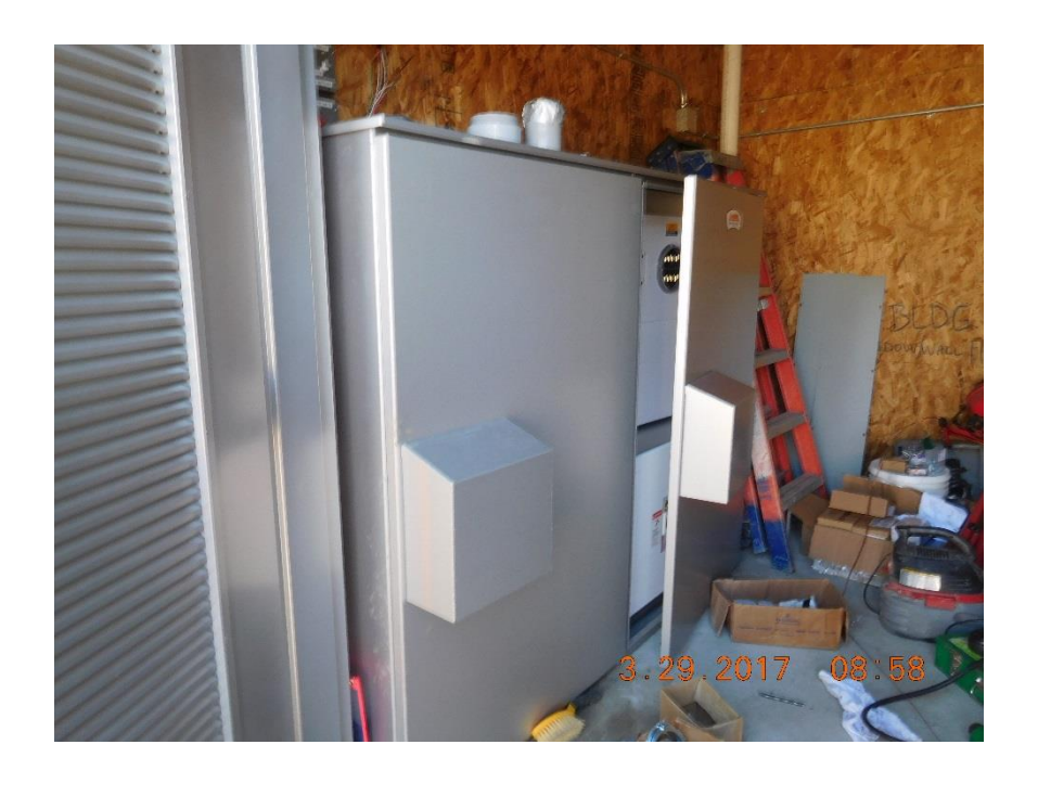
Electrical Breaker Box inside Eastern Kiosk