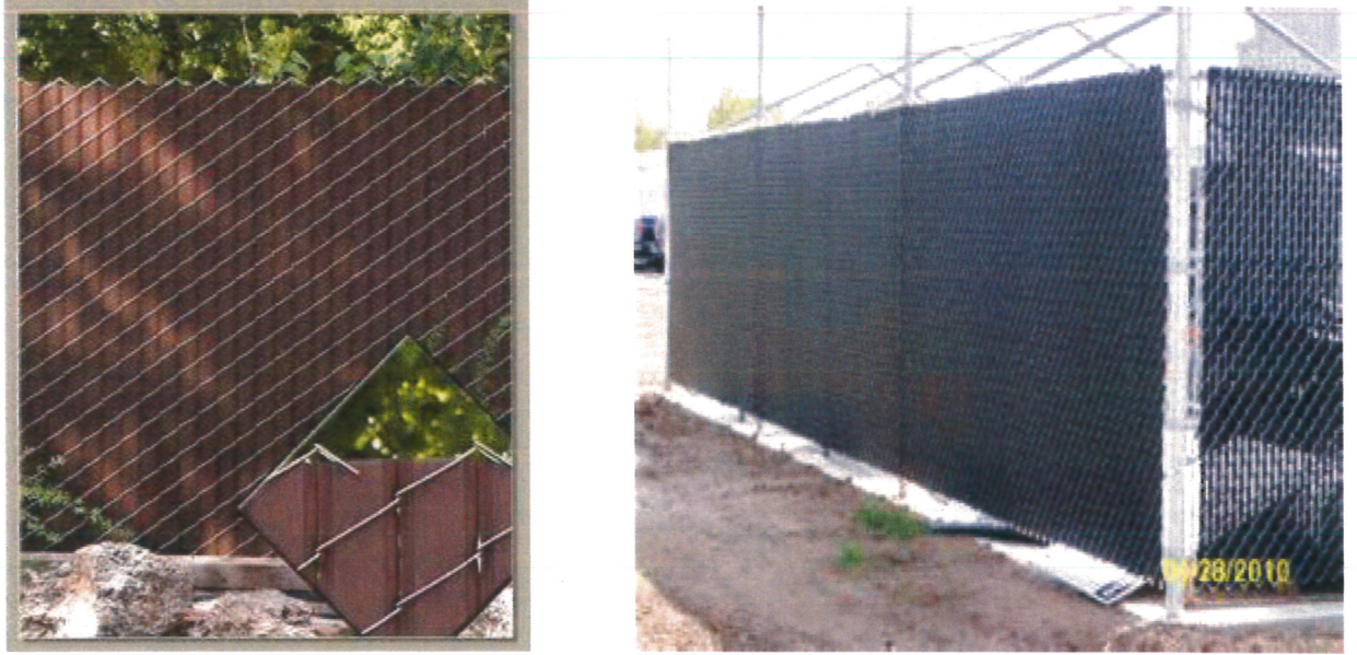
Type of slatted fencing proposed