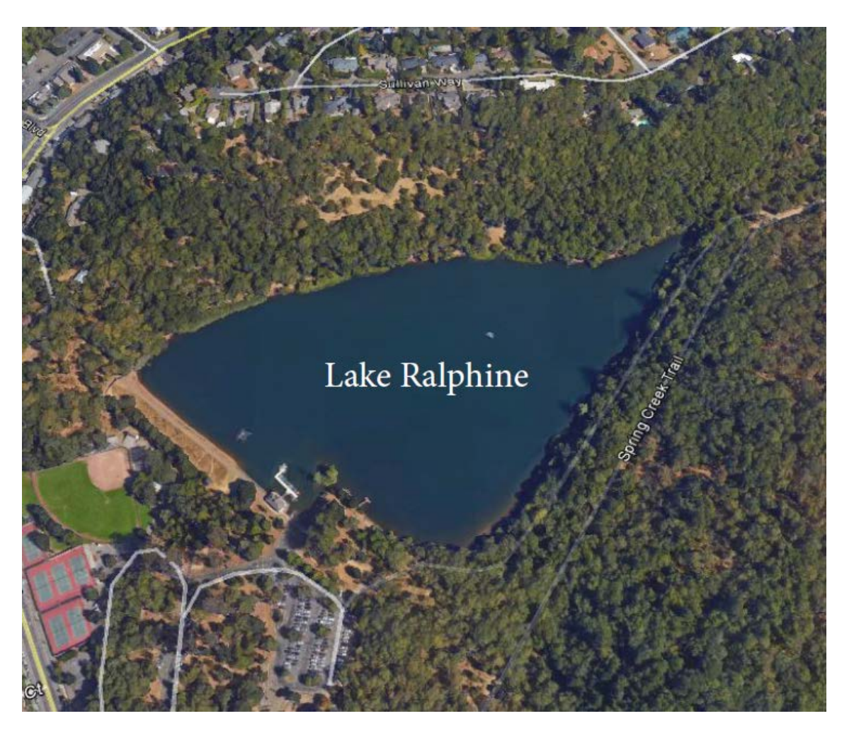
Howarth Park / Lake Ralphine