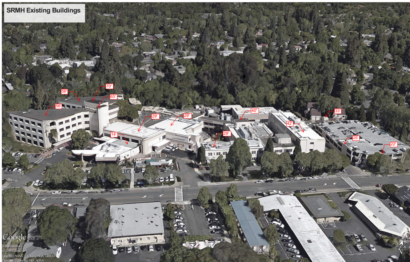
Figure 1: Building Heights of the Santa Rosa Memorial Hospital Medical Complex located on the North side of Montgomery Drive

As depicted in the images below (Source sheets 11e), the scale of the project will be compatible with the existing hospital and the more recent medical office development on Doyle Park Drive. The height of the MOB is 61 ft./69 ft. (parapet) above grade and the parking structure is 70' at its highest elevator tower with the bulk of the garage at 56'2" above grade. The existing hospital at its highest point is 70' above grade with the patient tower at 56'. The new buildings will use materials of stucco and stone along with a color scheme compatible with the existing hospital to provide visual interest and yet be compatible with the neighborhood.