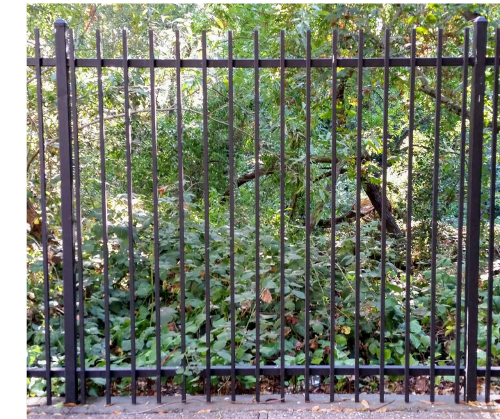
6' High Ornamental Iron Fence (Existing and Proposed)