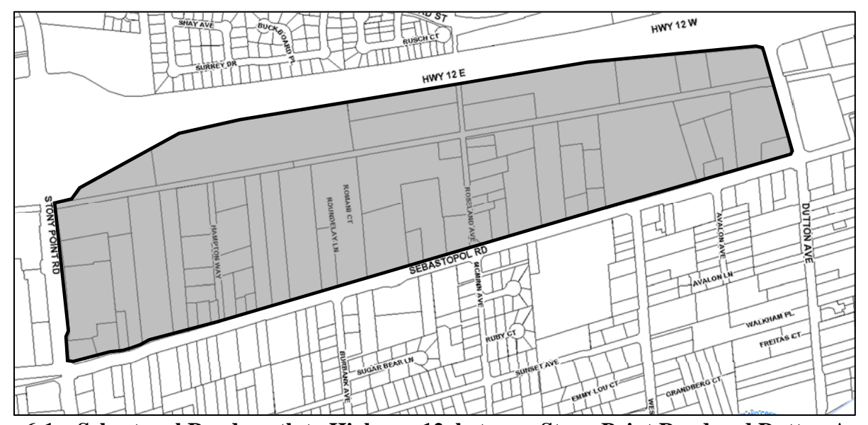
Figure 6-1 – Sebastopol Road north to Highway 12, between Stony Point Road and Dutton Avenue