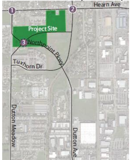
Figure 1-Roseland Specific Plan

Below, Figure 1 shows the Roseland Specific Plan approved alignment, while Figure 2 shows the Developer's Proposed alignment.