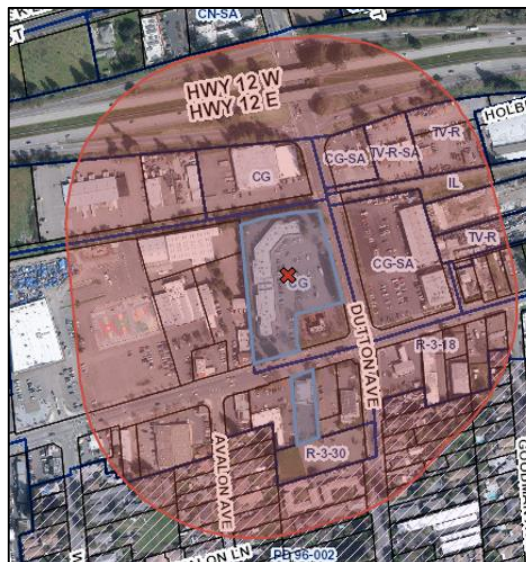
Figure 2: Consequence of choosing Highway Retail Outlet is voiding Phenotopia.

A City Planning staff review team independently reviewed and scored the applications individually against four criteria that were identified in the City's Cannabis Use Application Retail Use Requirements (published on www.srcity.org/cannabis ), resulting in a staff recommendation to select the application with the highest-ranked average score. Points were awarded based on the quality and extent that an application addressed the merit criteria. Staff findings and applicant proposals were presented to the City Council's Cannabis Policy Subcommittee, who then selected which applications move forward with the Conditional Use Permit review process. Reviewers awarded Highway Retail Outlet 65.4 average points, and Phenotopia 92.4 average points. A total of 100 points could be awarded for all criteria.