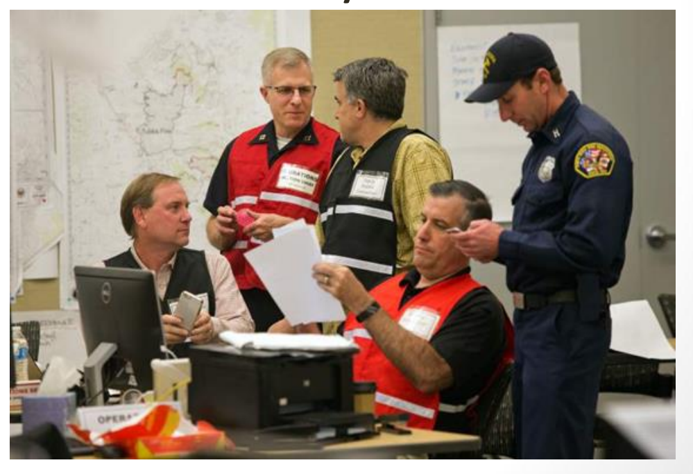
City of Santa Rosa EOC