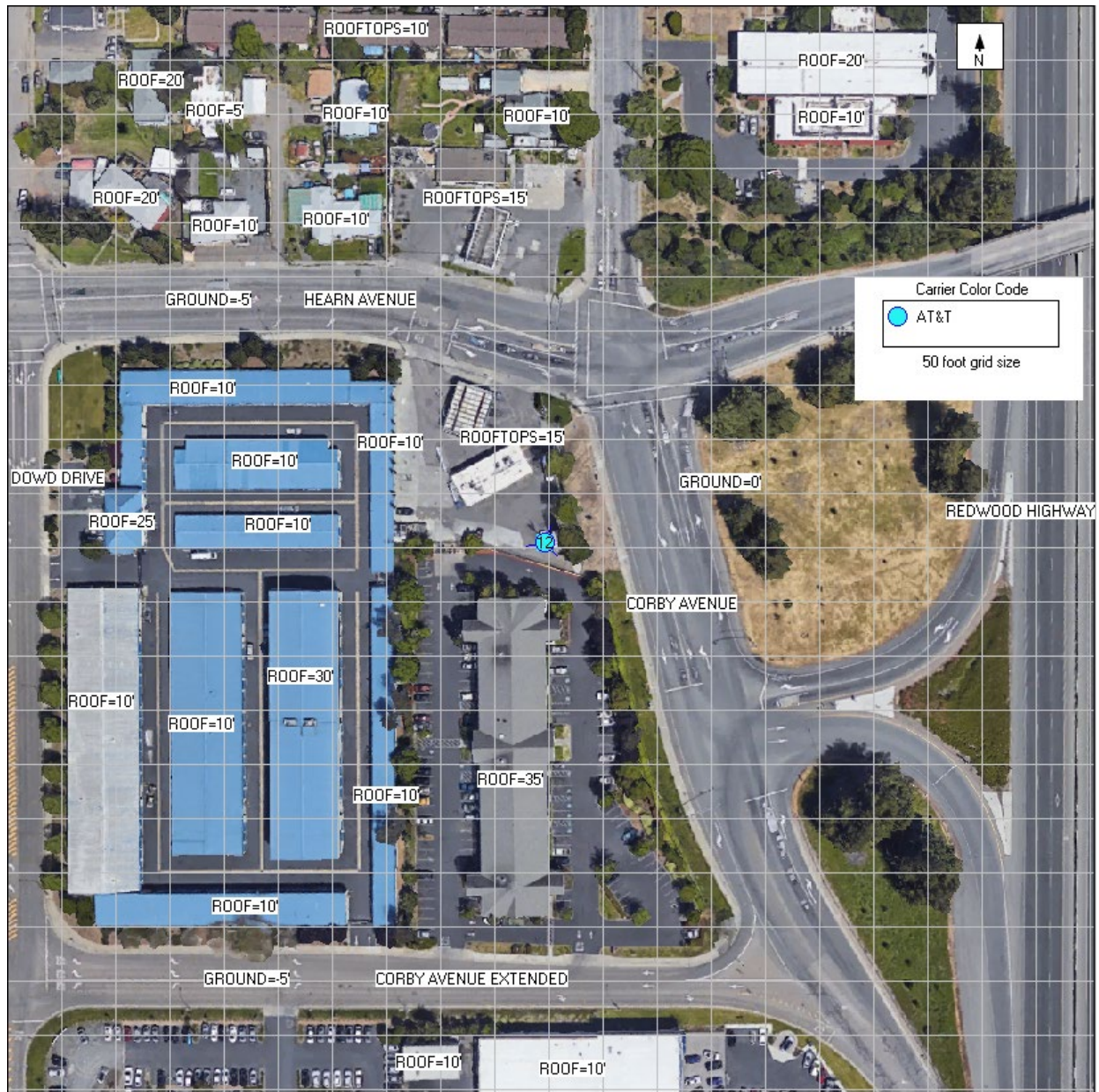
Figure 1: Antenna Locations