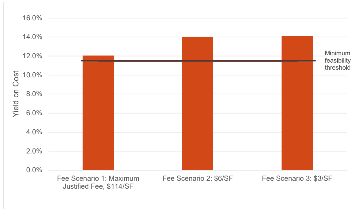
FIGURE 6: FEASIBILITY RESULTS, HOTEL PROTOTYPE