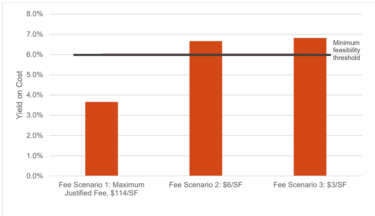
FIGURE 8: FEASIBILITY RESULTS, BUSINESS PARK/LIGHT INDUSTRIAL PROTOTYPE