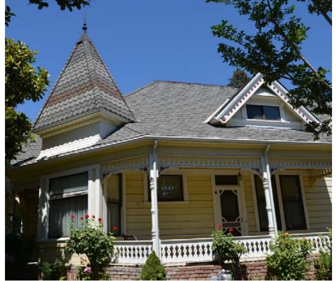
4. McDonald Avenue