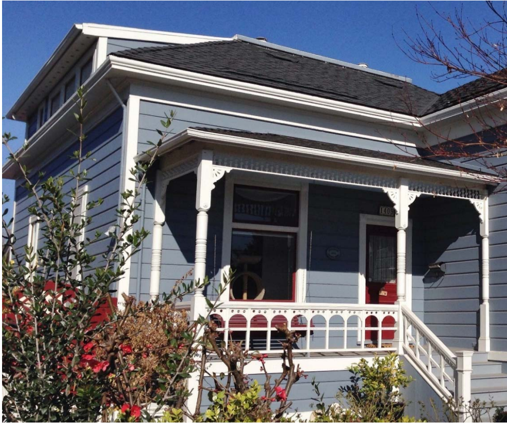
1. Downtown Santa Rosa