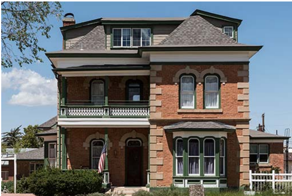
2. 1889 Italianate Style Bauer Mansion