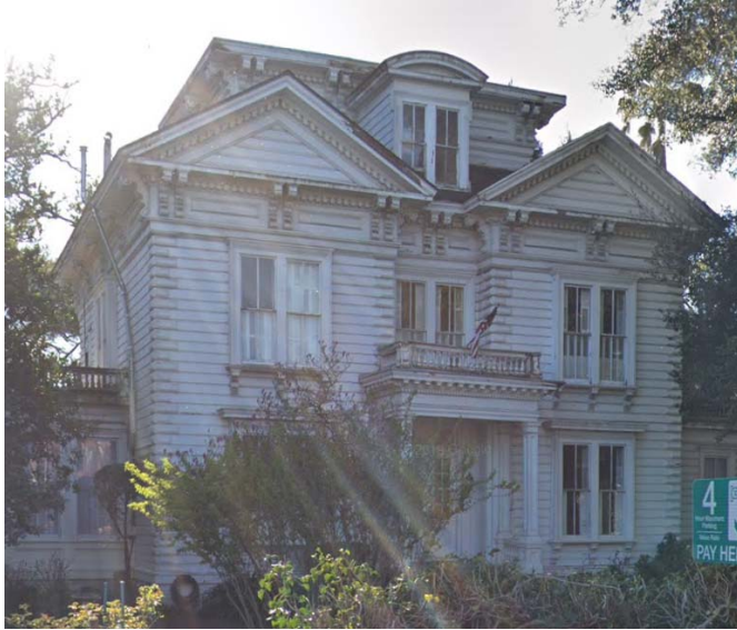
3. Downtown Santa Rosa