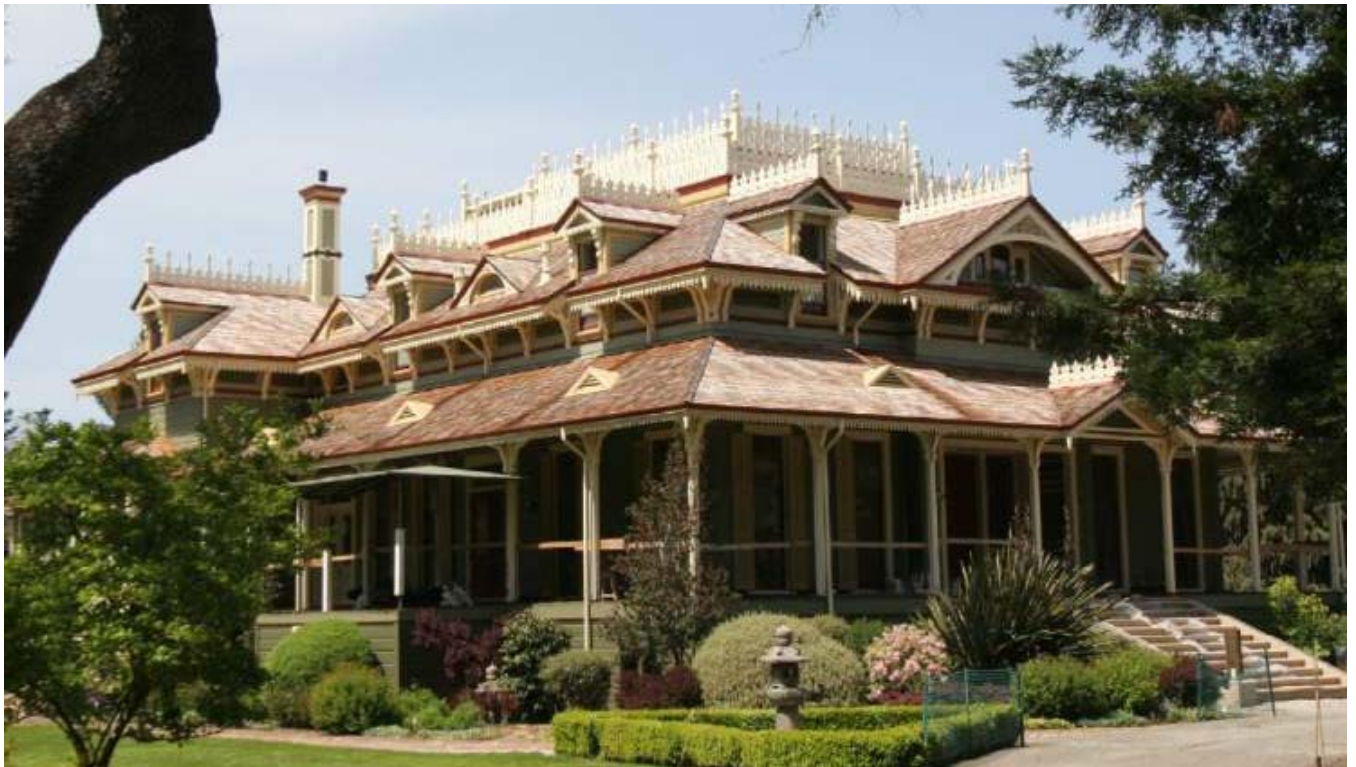
5. McDonald Mansion