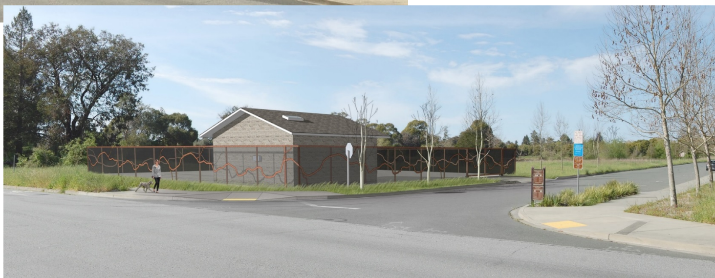
Proposed emergency ground water well and pump