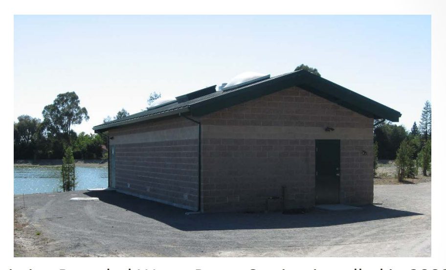
Existing Recycled Water Pump Station installed in 2008