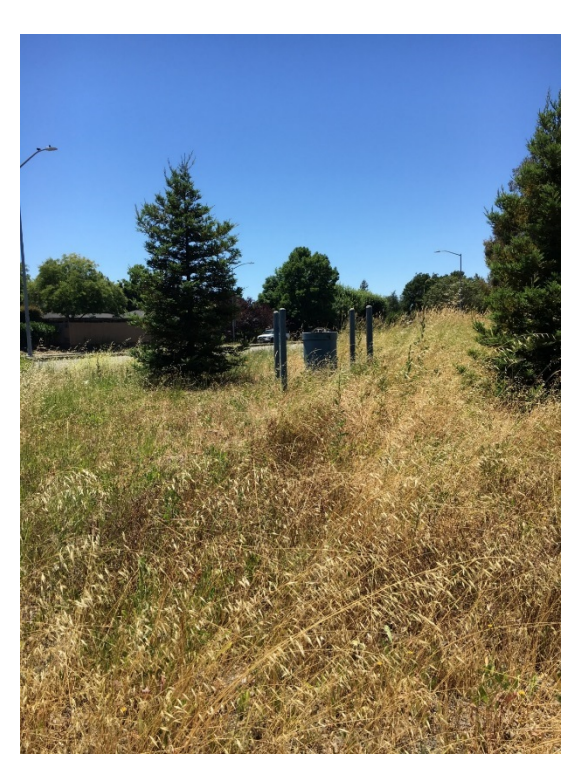
Existing Test Well installed in 2006