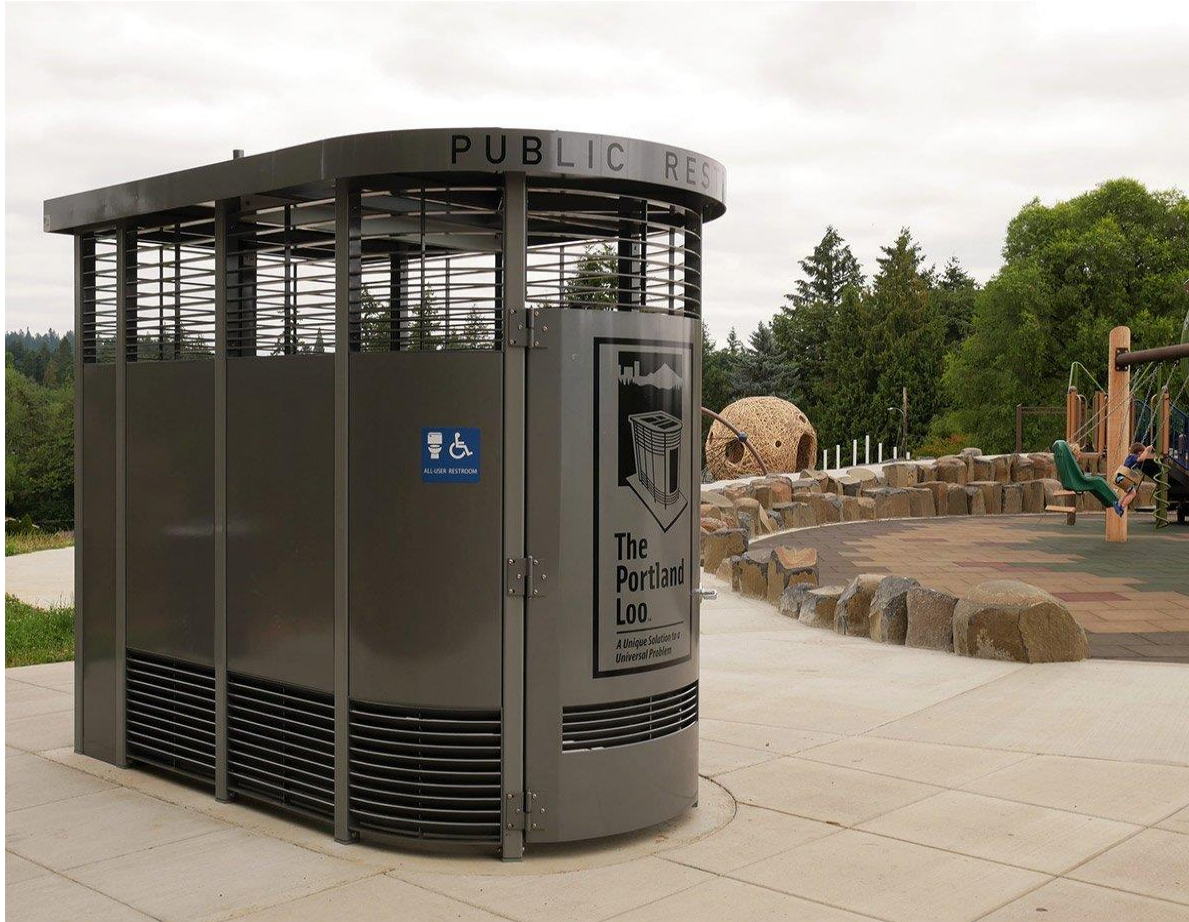
The Portland Loo