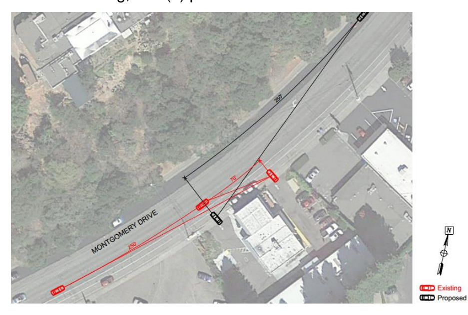
Figure 1. Existing and Proposed Line-of-sight

To improve the line-of-sight for motorists exiting the driveway, the applicant proposes reversing to clockwise the direction of the on-site one-way circulation. By reversing the direction, the line-of-sight for motorists increases from 70 feet to 250 feet without the loss of any street parking spaces, as shown in Figure 1.