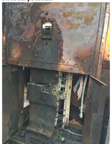
Main electrical distribution panel.