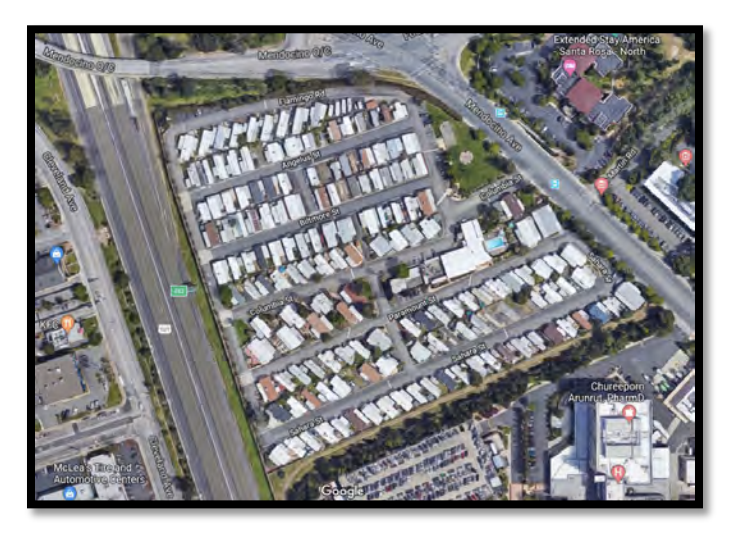
Figure 1: Journey's End Mobile Home Park, pre-2017 wildfire

Prior to the 2017 wildfire, the Park was home to 160 senior households and one manager's unit and was a fully developed mobile home park including paved roads and driveways, and gravel pads for the mobile homes. Park amenities included a clubhouse, pool, game room, laundry room, RV storage, car wash, and dog run available for use by its residents. Vegetation on the site was very limited, including a small lawn area near Mendocino Avenue and small landscaping areas adjacent to individual mobile homes. Entrance to the Park was gained from the west side of Mendocino Avenue and a network of on-site streets allowed access for vehicles throughout the Park. Pacific Gas & Electric provided gas and electric utilities to the Park site and sewer service was provided by the City of Santa Rosa. Water supply was provided from two private on-site wells and an aboveground water distribution system (See Figure 1). The monthly average rent previously offered at the Park was approximately $650 per month.