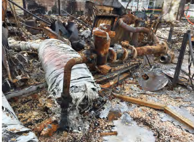
Typical Lot with sewer inlet full of debris