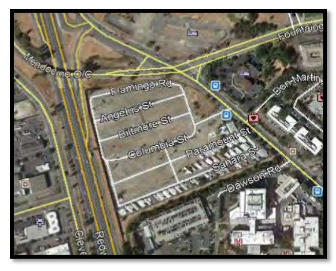
Figure 2: Journey's End Mobile Home Park, post-2017 Tubbs wildfire

In the early morning of October 9, 2017, the Tubbs wildfire destroyed the Park's infrastructure and 117 of the mobile homes. The 44 mobile homes that remained standing following the wildfire have been uninhabitable since the wildfire due to damaged utilities. In the months following the wildfire, HCD issued a report documenting the extent of the destruction to the Park and its infrastructure. In that report, HCD prohibited occupancy of the Park "until the Park infrastructure is rebuilt, replaced or corrected" (See HCD Report at Attachment F). Subsequent to the HCD report, the State Water Resources Control Board determined that the on-site well that historically provided water to the mobile homes can no longer be used for domestic purposes and it was determined current plumbing codes will not allow the use of an aboveground water distribution system like the one that existed in the Park prior to the wildfire. As a result, no residents have resided in the Park in the more than two years since the wildfire occurred (As required by Santa Rosa Municipal Code Section 20-28.100.J.3.c.2; See Figure 2). Given the significant cost to construct a new water system connected to City water service, as well as restore the Park's sewer, gas, and electric systems, the Park Owner has concluded that it is not economically feasible to reopen the Park and it is, therefore, necessary to undertake the formal Park closure process required by the Government Code and Santa Rosa Municipal Code.