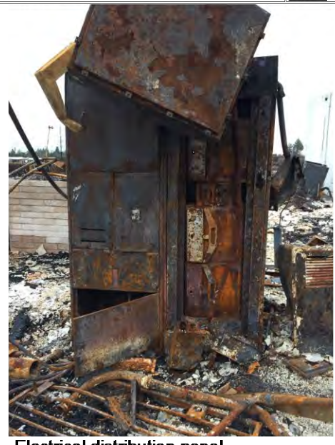
Electrical distribution panel.