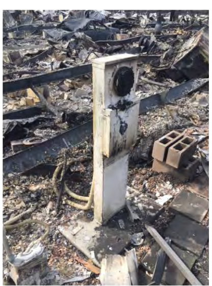
Typical example of destroyed electrical pedestal.