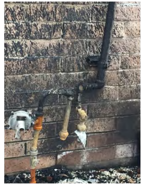
Gas meter connection