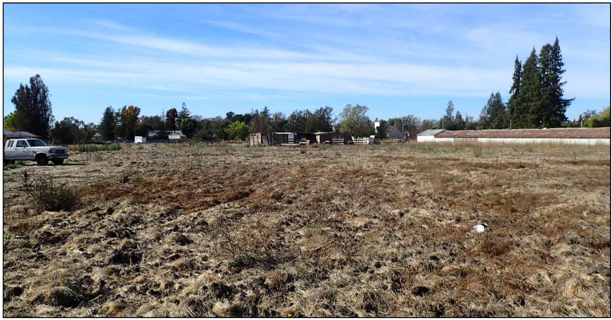
Photograph 2. Photograph depicting non-native grassland within the Study Area, which is highly disturbed by discing or plowing.