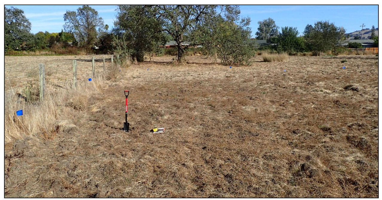
Photograph 1. Photograph depicting a seasonal wetland on the northern border of the Study Area.