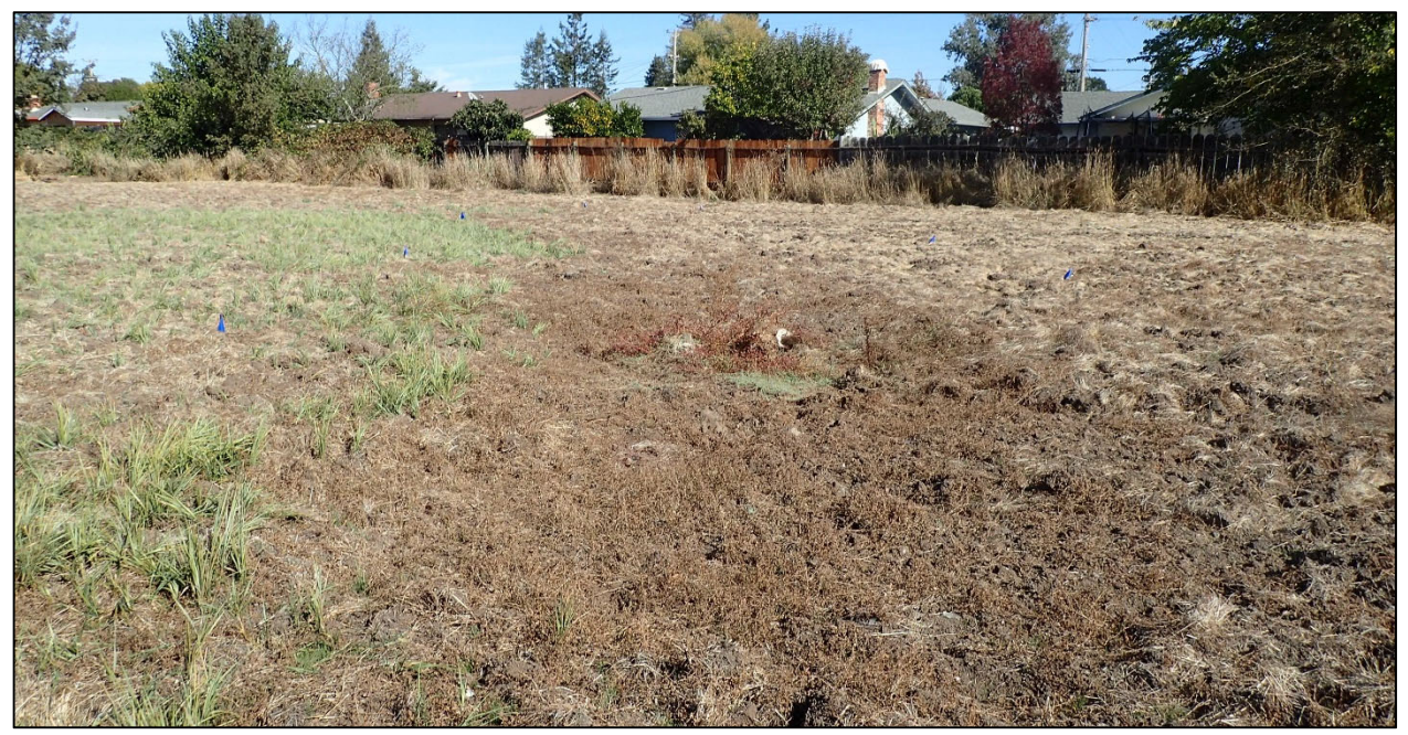
Photograph 3. Photograph depicting a seasonal wetland within the Study Area.