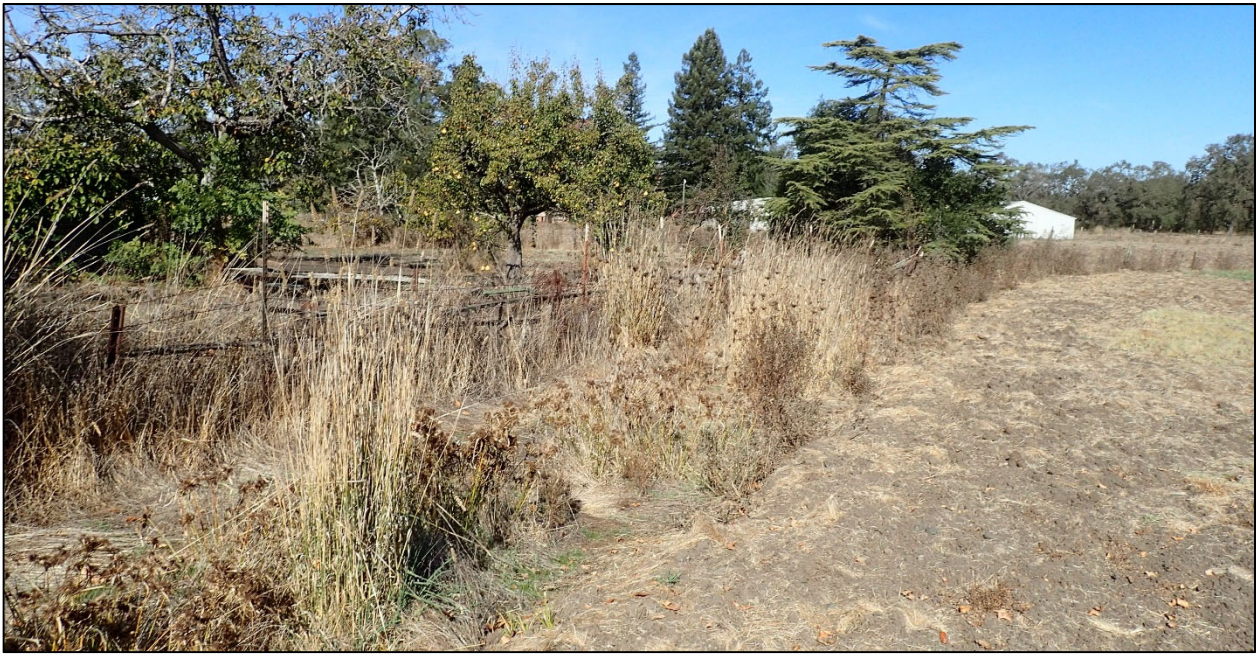
Photograph 4. Photograph depicting seasonal wetland ditch within the Study Area.