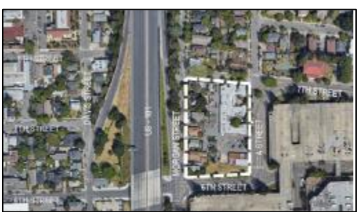
Figure 1: Project site is located immediately east of Highway 101 and the Highway 101 on-ramp at 7th Street.

Caritas Village is a proposed project that includes the redevelopment of a city block into a comprehensive family and homeless support services facility/emergency shelter (Caritas Center) to be operated by Catholic Charities, and a 126-unit affordable housing development (Caritas Homes) to be operated by Burbank Housing.