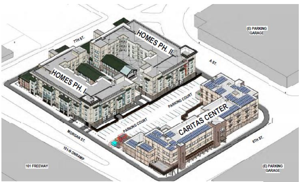
Figure 2: Caritas Village 3D Rendering

The 2.78-acre project site is within the west part of downtown; bordered by 7th Street to the north, A Street to the east, 6th Street to the south, and Morgan Street to the west. The project site is fully developed and consists of Catholic Charities' Homeless Services Center and Family Support Center. In addition, there are several residential dwelling units on the project site that are either vacant or owned by Catholic Charities to provide transitional housing. Development surrounding the project site mostly consists of single-family homes within the St. Rose Historic District, as well as some office and commercial uses such as the Santa Rosa Plaza shopping mall, Sonoma County Museum, and the St. Rose Church that is now used for professional offices. The project site is also located immediately east of Highway 101 and the Highway 101 on-ramp at 7th Street.