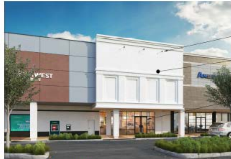
Proposed North Elevation