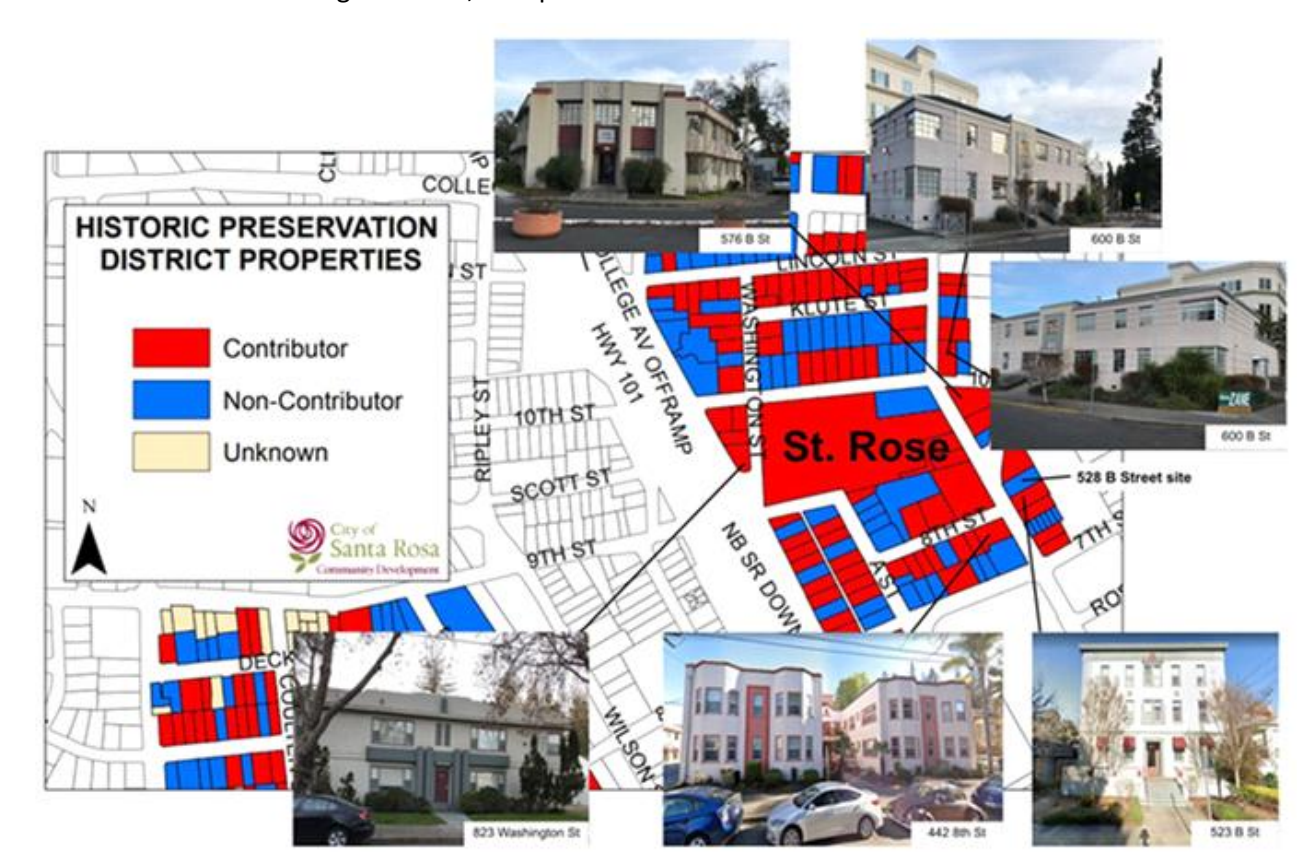
FIGURE 1. Character Defining Elements, as represented in contributors within the St. Rose district.

Not all historic precedent or traditional contextual design elements are compatible, nor are they sensitive to the 1920's period of significance that is the conceptual foundation of the proposed structure. As previously referenced an eclectic makeup of significant or contributing structures in the St. Rose Historic Preservation District poses a challenge when designing a "compatible" present day addition to the neighborhood. One that celebrates these traditional contextual design elements, is sensitive to the context and is not an expression of false historicism. For a new building to successfully contribute to the district the compositional themes of the predominate eras within the district would take precedence over contemporary or modern themes.