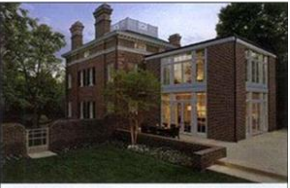
Figure 4. This glass and brick structure is a harosonious addition set back and connected to the rear of the Celevial Revival style brick house. Cumringham/Quill Architects.