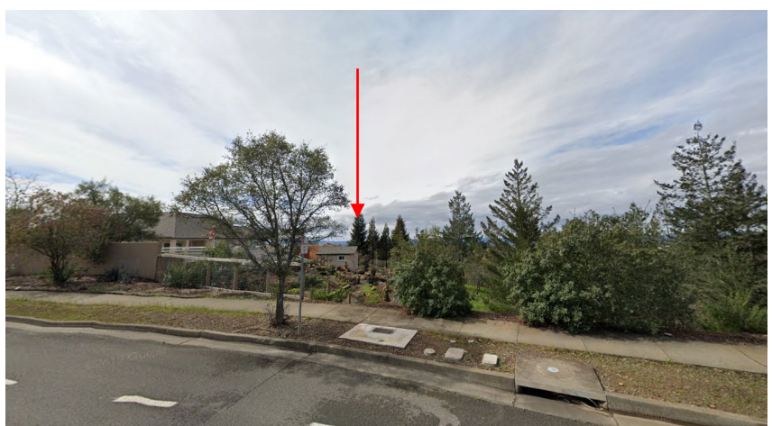
View from Fountaingrove Pkwy