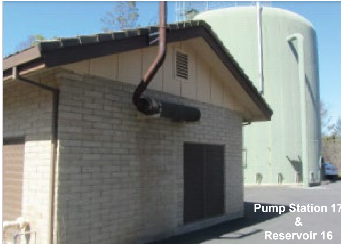
Pump Station 17 & Reservoir 16