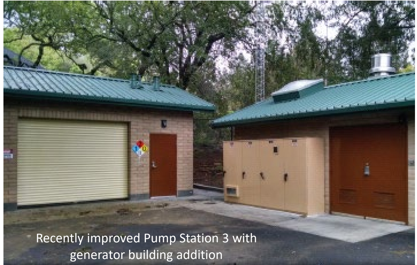
Recently improved Pump Station 3 with generator building addition