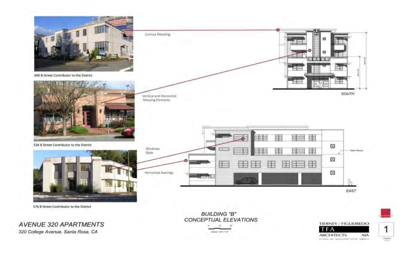
FIGURE 3 & 4. District- Character Defining Elements referenced in new design & Historic References used