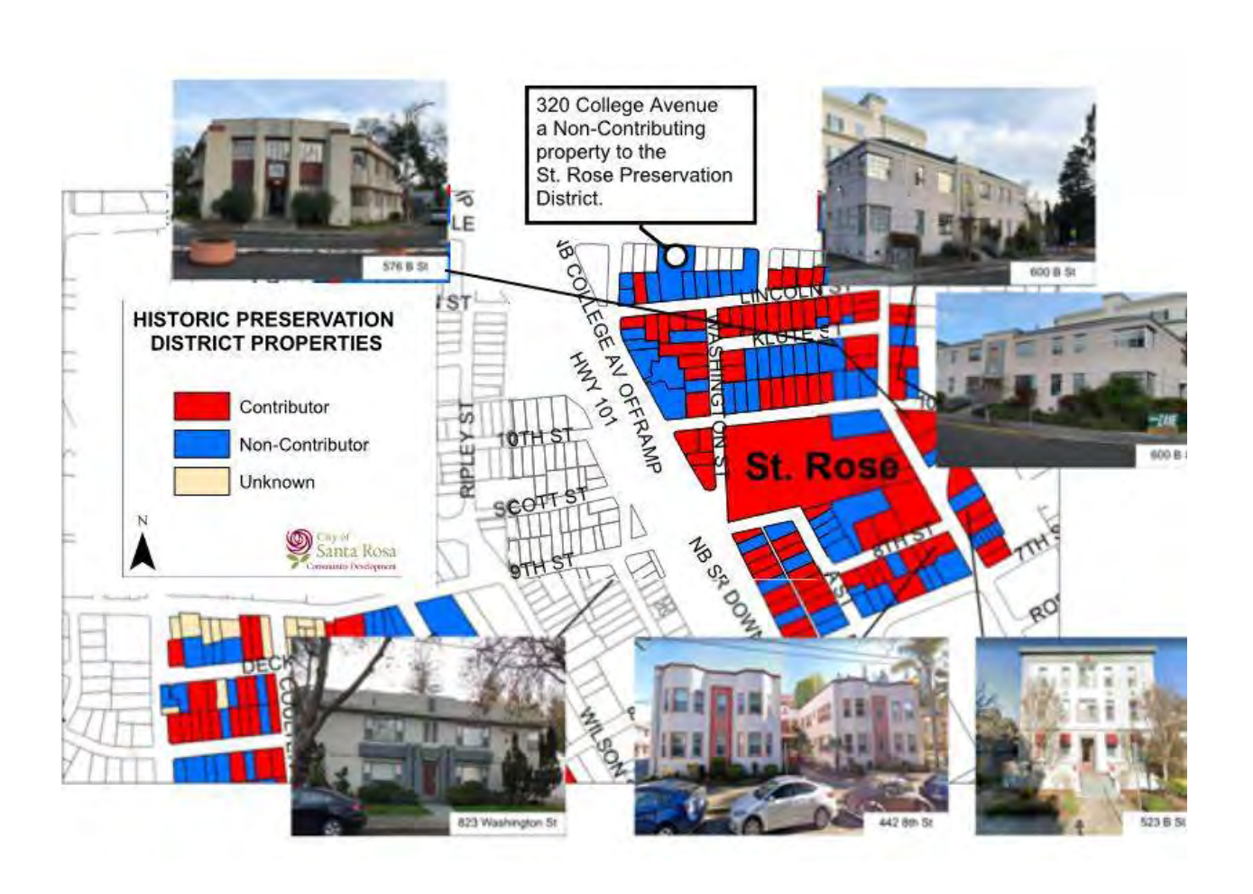
FIGURE 1. Character Defining Elements, as represented in applicable contributors within the St. Rose district.

Conversely, contrasting buildings have received approval in other instances, but one has to be careful as too many contrasting buildings are often equated with erosion of the district fabric, or artificiality. Thus, a building of this scale, as allowed by the CD-5-H-SA zoning district standards, is encouraged by the City of