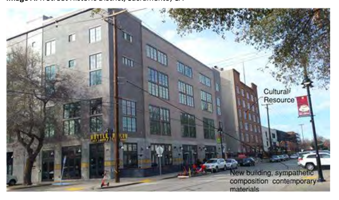
Treatment C. Compatible Composition in Contemporary Materials Image A. R Street Historic District, Sacramento, CA

Secondary features, executed with contemporary materials and systems, should be consistent with historic proportions and detailing, and should accurately reflect the historic precedence or character-defining elements within the district. The balance of new materials and systems that honor, or reflect historic forms and compositions can create a sympathy and cohesion within the district, thus avoiding a false historicism created by contemporized historic systems.