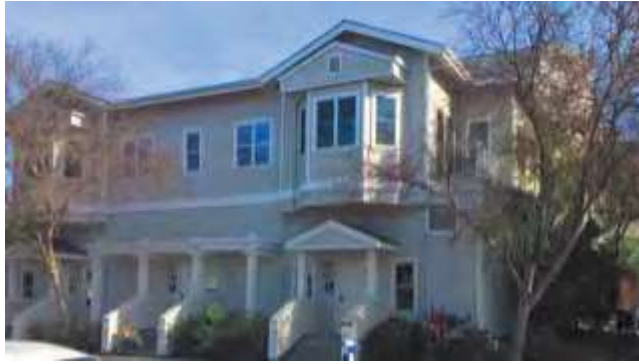
The B Street Side of the Six One Five Apartments (old Moore Center). After working with the neighborhood, the architect (Henry Wix) redesigned this portion of a very imposing 4 story apartment building on Healdsburg Avenue and 10th Street to fit in with the character of the houses on the street.