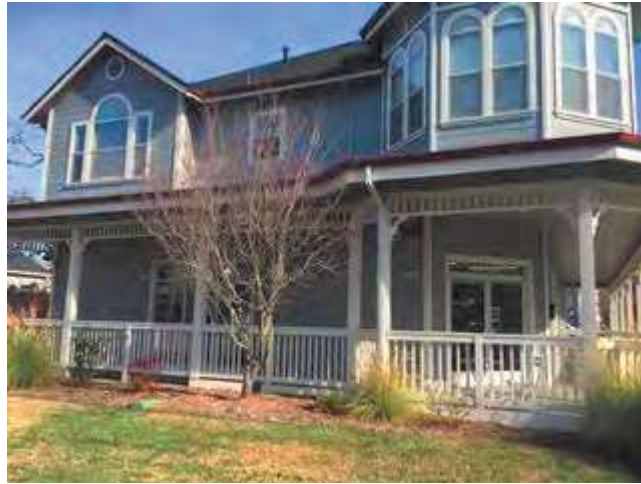
An office building on the corner of 8th and A Streets.

very imposing 4 story apartment building on Healdsburg Avenue and 10th Street to fit in with the character of the houses on the street.