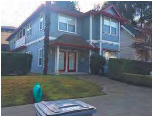
An apartment on 8th street.

A stacked duplex and a single family home. Behind both are ADUs over garages. On 10th and Washington Streets.