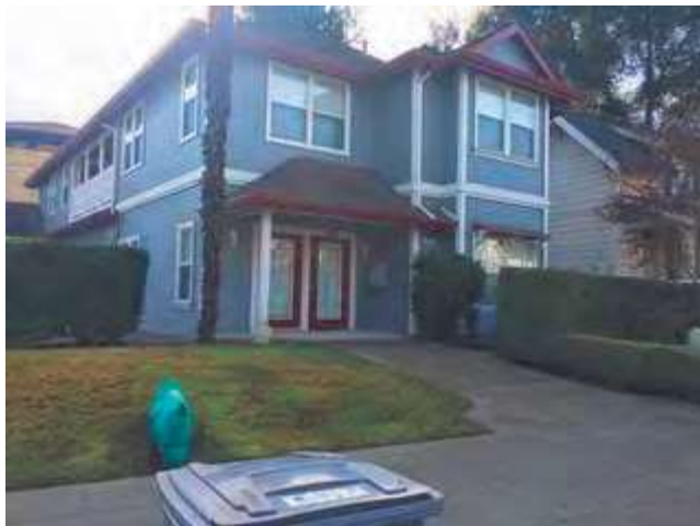
An apartment on 8th street.