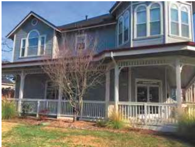
An office building on the corner of 8th and A Streets.