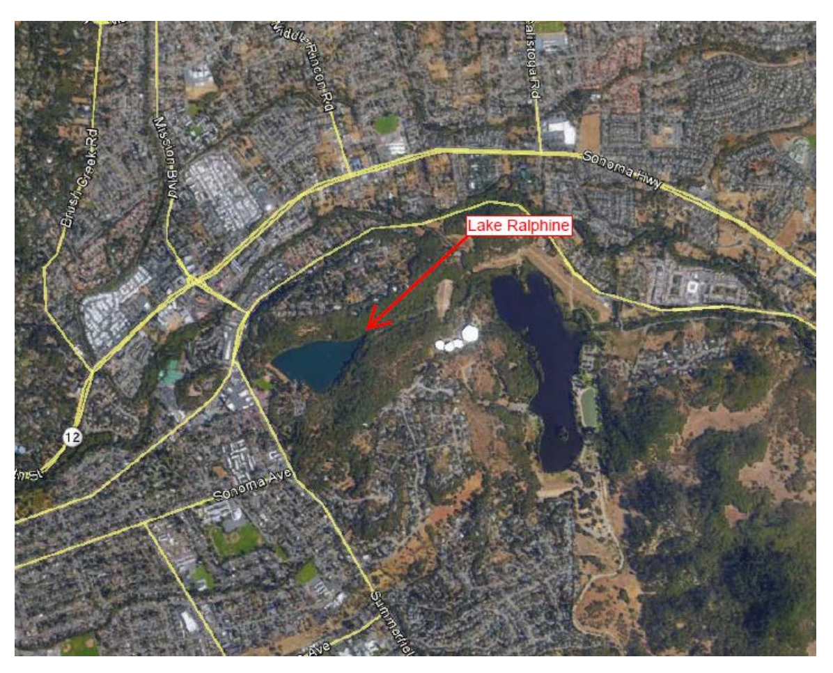
Howarth Park / Lake Ralphine