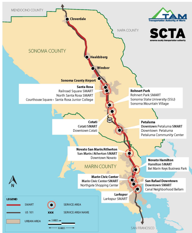
Marin-Sonoma SMART Access Bike Share Program Vicinity Map - Proposed Station Areas