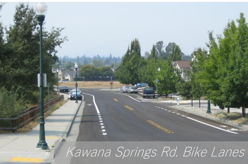
Kawana Springs Rd. Bike Lanes