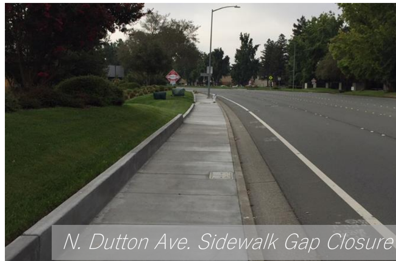
N. Dutton Ave. Sidewalk Gap Closure