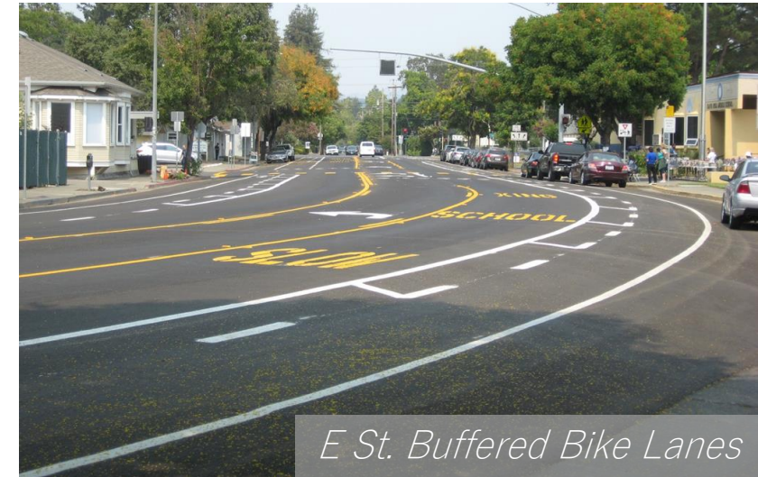
E St. Buffered Bike Lanes