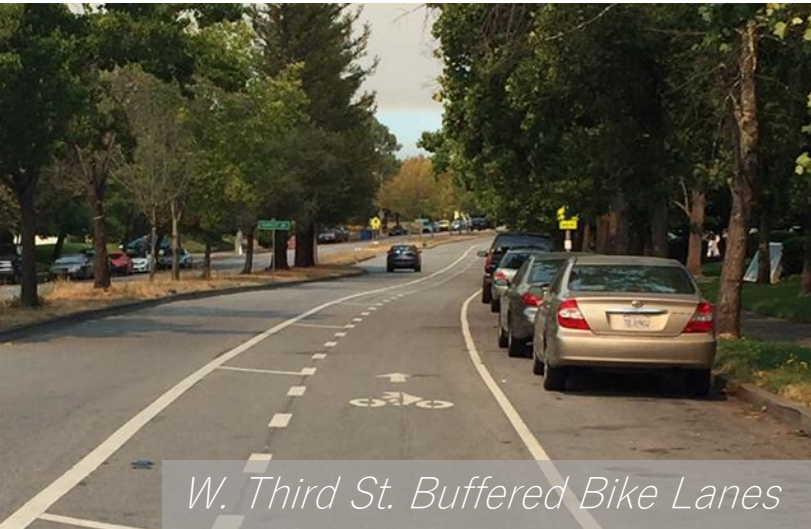
W. Third St. Buffered Bike Lanes