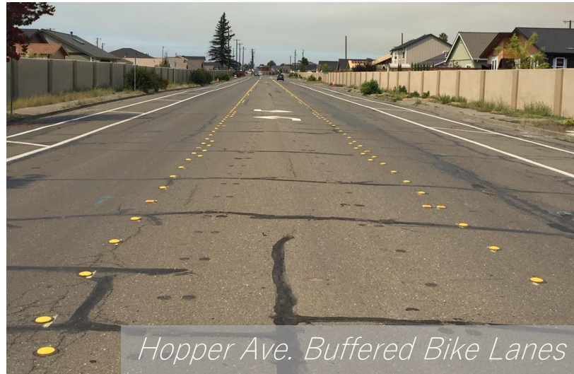
Hopper Ave. Buffered Bike Lanes