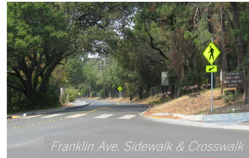
Franklin Ave. Sidewalk & Crosswalk