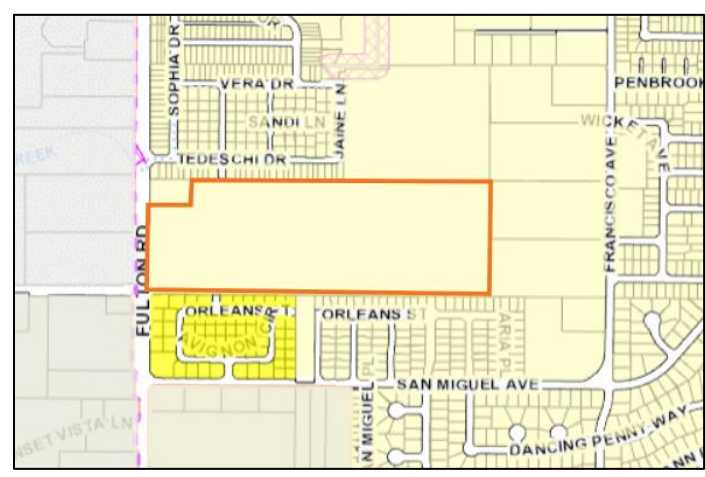
Figure 2: The project site is designated Low Density Residential.

The project site is designated Low Density Residential on the Santa Rosa General Plan 2035 land use diagram, which allows residential development at a density of 2 to 8 dwelling units per acre. Except for the Medium-Low density designation to the southwest, the parcels in the surrounding area share the same or similar land use designation.