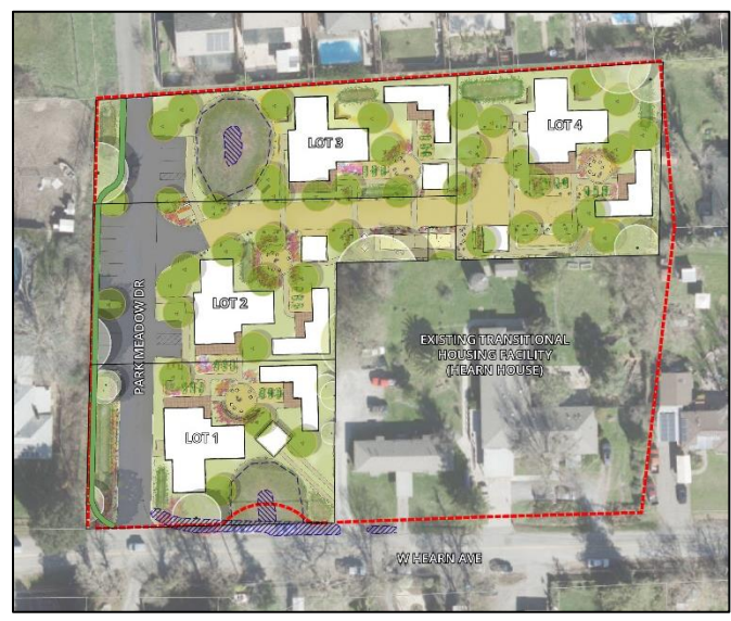
Figure 4: Proposed Parcels Configuration- Hearn Veterans Village

Access to the project site is proposed at the southwest corner via an existing driveway and a new 24-foot private access easement which will also serve as an emergency vehicle access easement (EVA) extending