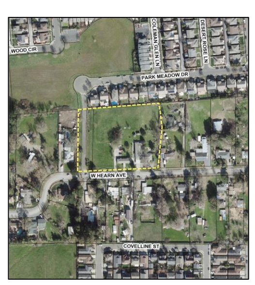
Figure 5: Aerial Map of project site.

The site is zoned Rural Residential and is within the Rural Heritage Combining District (RR-20-RH). The site is currently undeveloped and predominantly contains native and nonnative grasslands, trees, and an existing paved pedestrian pathway and emergency vehicle access along the western portion of the site. Surrounding land uses include Low, Medium-Low, and Medium Density Residential.