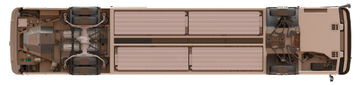
Figure 1 Locations of HV Battery Packs for ZX5 + Configuration (4 packs)