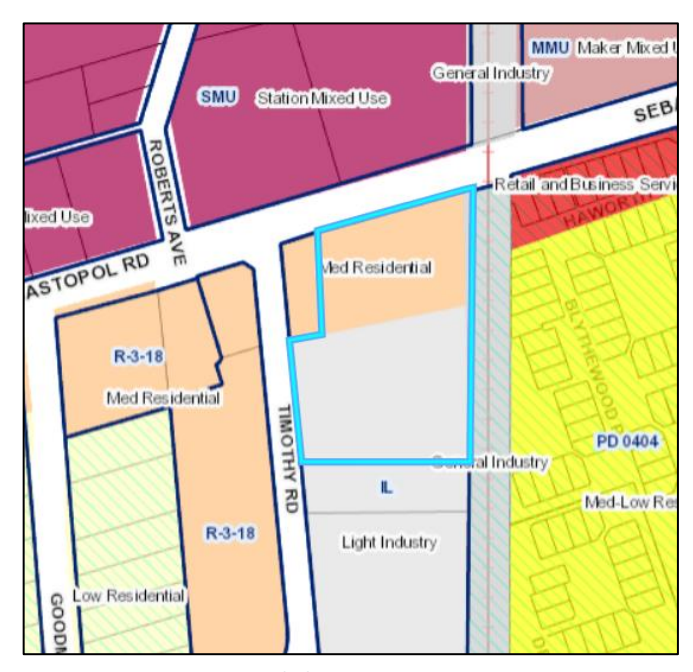
Figure 3: Zoning & General Plan Designations

Staff has determined that Cannabis Cultivation, Manufacturing, Distribution and Retail (Dispensary) and Delivery uses are consistent with the General Plan goals and policies of the Light Industry land use designation. Specifically, the proposed use would assist in maintaining the economic viability of the area: broaden the available positions for both full and part time employment within the City; and provide a viable commercial service, while ensuring compatibility with the surrounding neighborhoods through proposed operational and security measures.