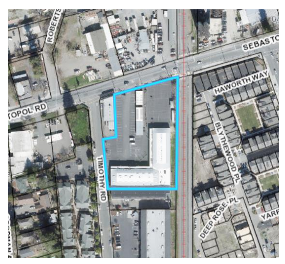
Figure 1: Project site and immediate vicinity.

Old School Cannabis (Project) proposes to operate a cannabis facility within an existing building. The following cannabis-related uses are proposed: 2,350-square-feet of Retail (Dispensary) with Delivery and onsite consumption; 17,120-square-feet for Commercial Cultivation (5,001-square-feet or greater); 870-square-feet for Distribution; 500-square-feet of Manufacturing – Level 2 (volatile). The applicant proposes to operate the retail dispensary, including delivery activities, between the hours of 9:00 am and 9:00 pm, 7 days a week. The applicant proposes to operate all non-retail portions of the business from 6:00 am to 9:00 pm.