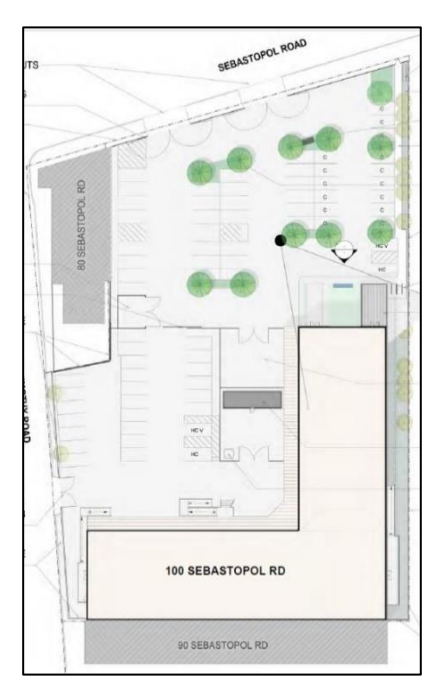
Figure 4: Proposed circulation changes.