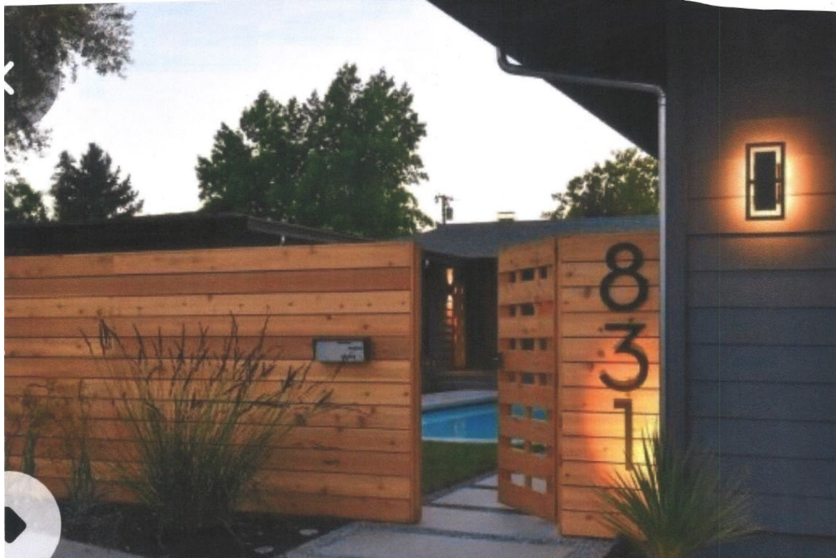
Example of proposed fence style