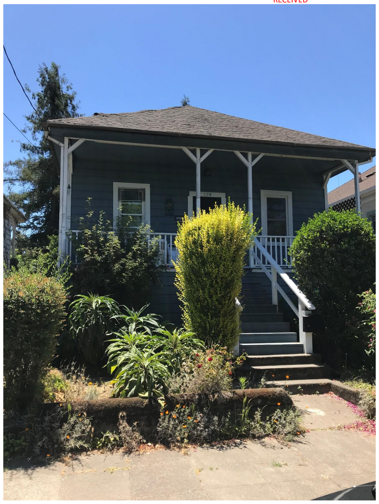
Front Elevation of Residence

City of Santa Rosa Planning & Economic Development Department Jun 4, 2021 RECEIVED