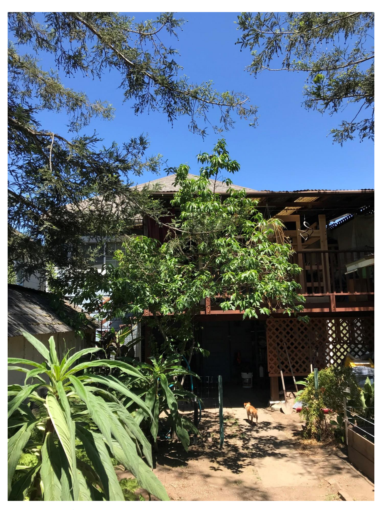
Rear of Residence/South Elevation of Deck to be permitted.