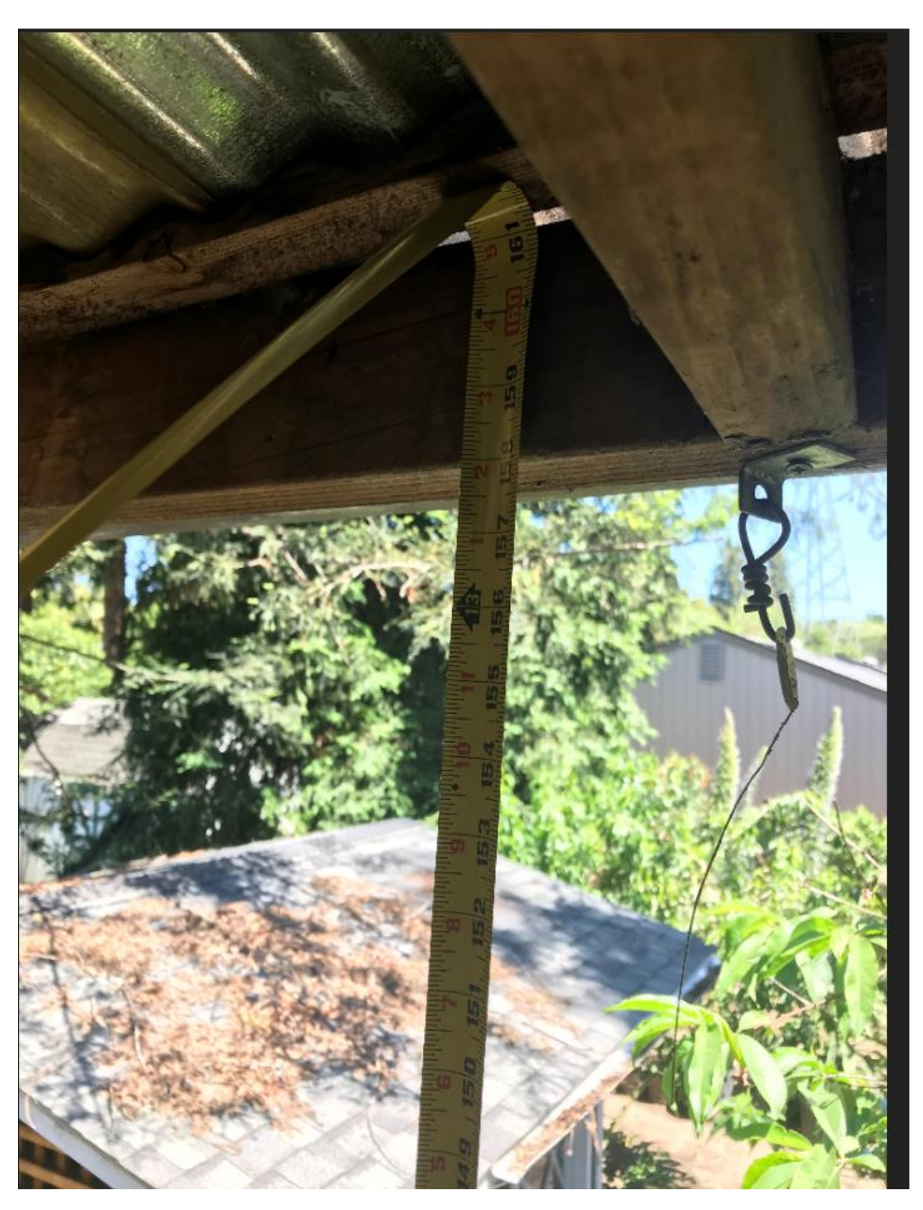
Grade to inside of roof ~13'-5' (616")