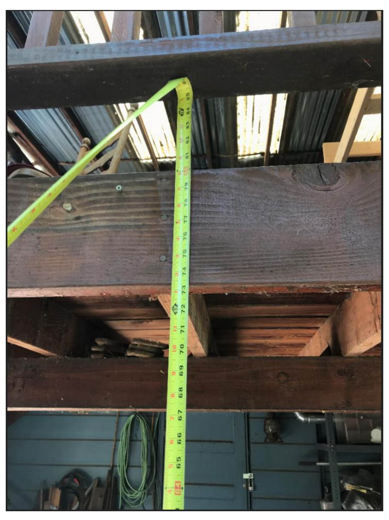
Grade to Top of Floor ~6'-8" (80 inches)