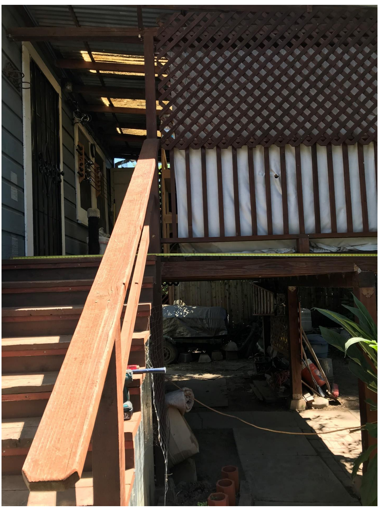
West Elevation of Deck