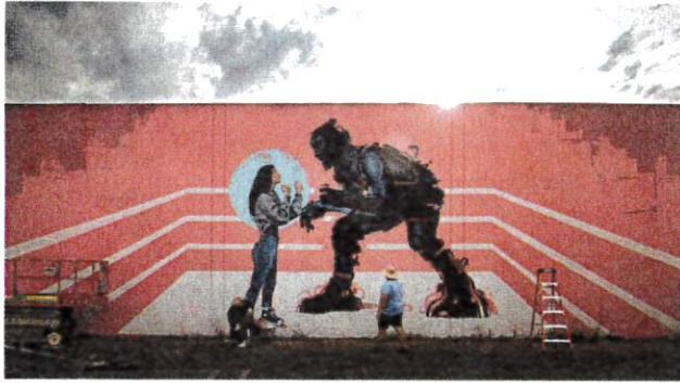
Good Vs. Evil : Located in Roseland, Santa Rosa