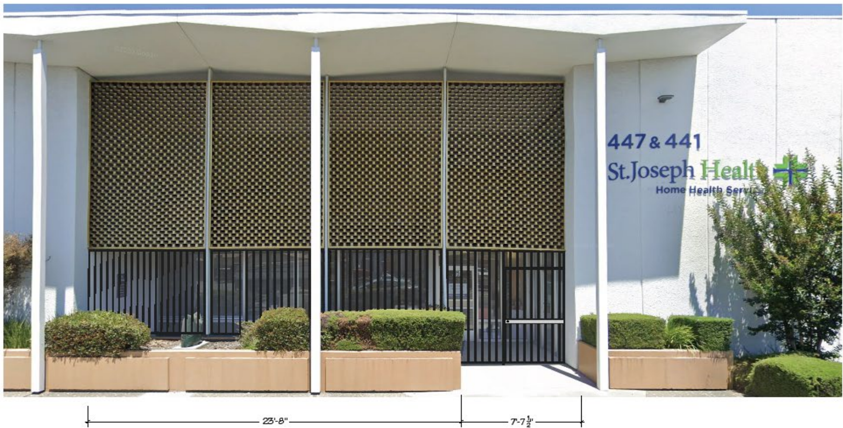
Photo Overlay of Entry