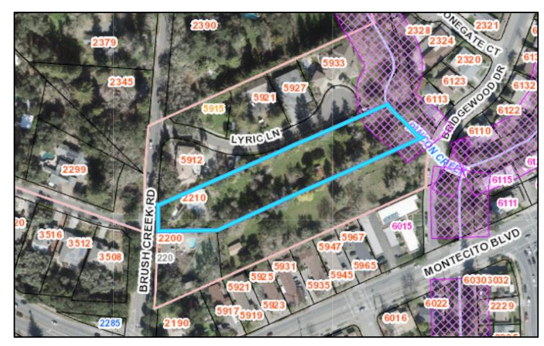
Figure 2: Aerial of surrounding properties.

There is an existing 1,470-square-foot single-family residence, and a 320-square-foot