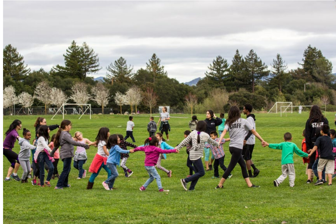
Valley Oak and Apple Valley after school programs