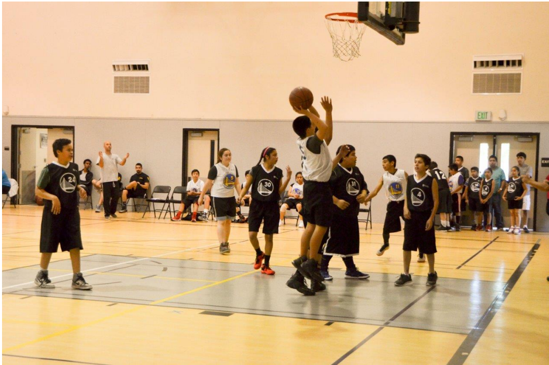
Junior Warriors at RAMS Middle School Gym