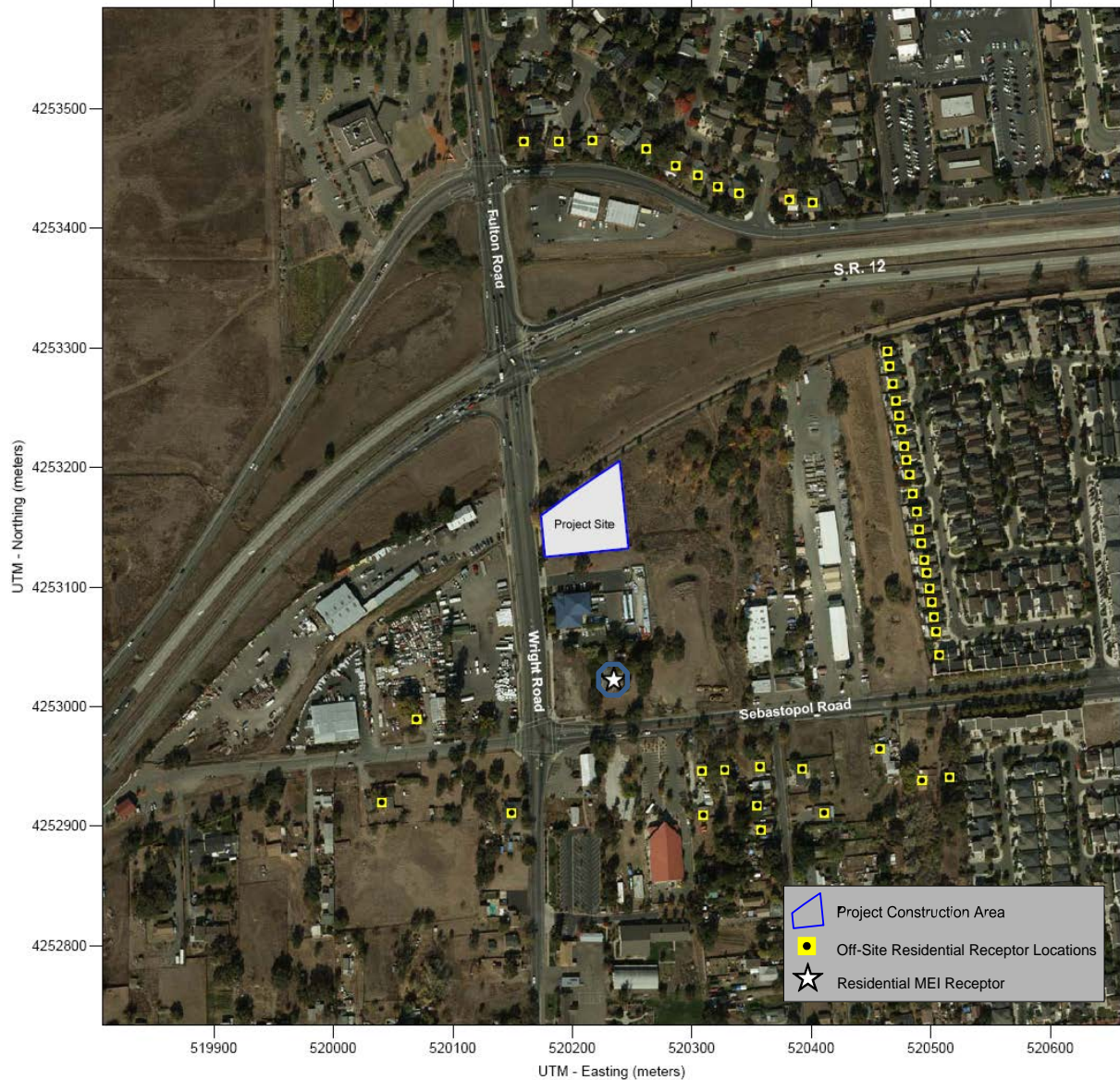
Figure 1. Project Site and Sensitive Receptor Locations

The primary TACs of concern from project traffic are DPM and non-diesel mobile source air toxics found in total organic gases (TOG). This includes 14 different toxic components of TOG exhaust emissions and five different toxic components of TOG evaporative emissions from gasoline vehicles. 13 DPM, TOG, and PM 2.5 emissions from customer vehicles were calculated using emission factors from the Caltrans version of the CARB EMFAC2017 emissions model, known as CT-EMFAC2017 14 , and the increased project-related traffic described above. Vehicle emission processes modeled include running/idle exhaust, running evaporative losses for TOG, tire and brake wear, and fugitive road dust. Vehicle emissions are projected to decrease in the future and are reflected in the CT-EMFAC2017 emissions estimates. Inputs to the model include region (i.e., Sonoma County), type of road (for road dust calculation purposes), traffic mix assigned by CT-