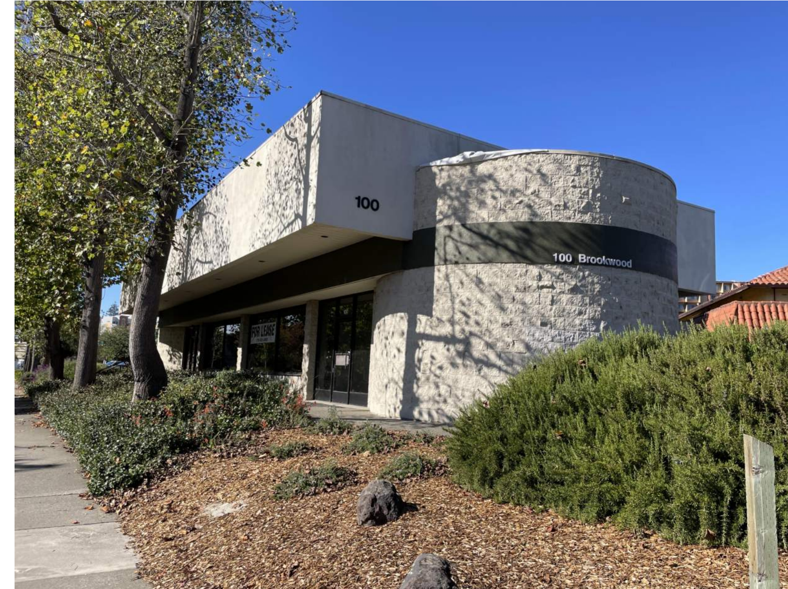
VIEW FROM BROOKWOOD