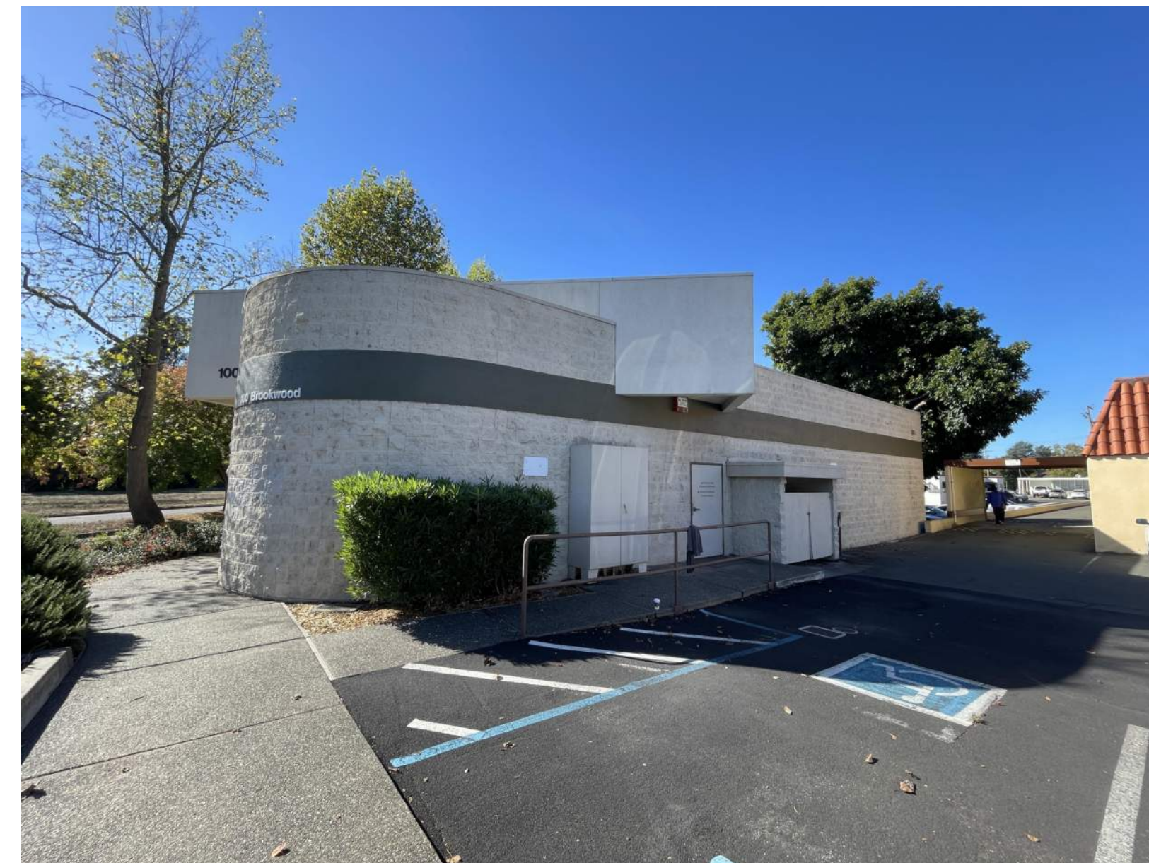
VIEW FROM PARKING