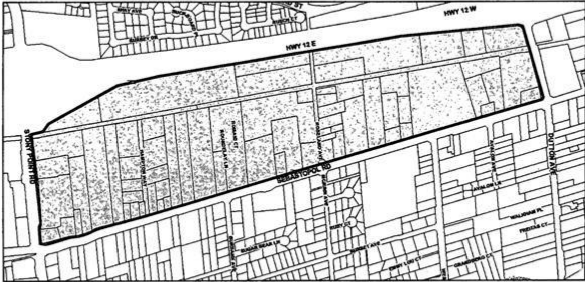
Figure 6-1 – Sebastopol Road north to Highway 12, between Stony Point Road and Dutton Avenue

4. Without further action by the City, any further use of the site shall comply with all of the regulations of the applicable zoning district and all other applicable provisions of this Zoning Code.