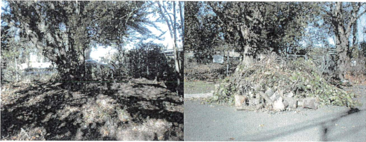
2013 The last coordinated neighborhood effort. Most have now moved out of the neighborhood.