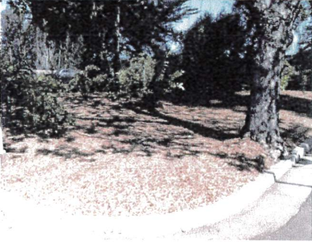
2021 Not a helpful plan to have a port a potty it was a further trash magnet and was even occasionally tipped over. Lorna was picking up the trash left behind.