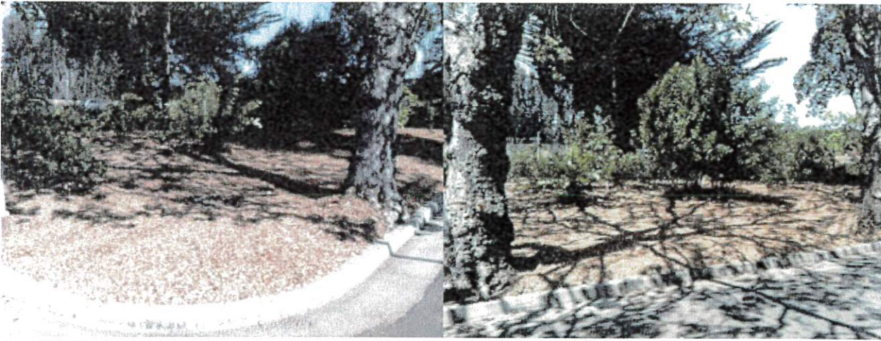
April 2013, 10 years ago