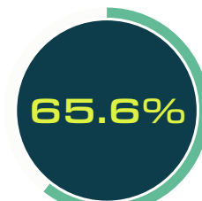
Labor Force Participation Rate