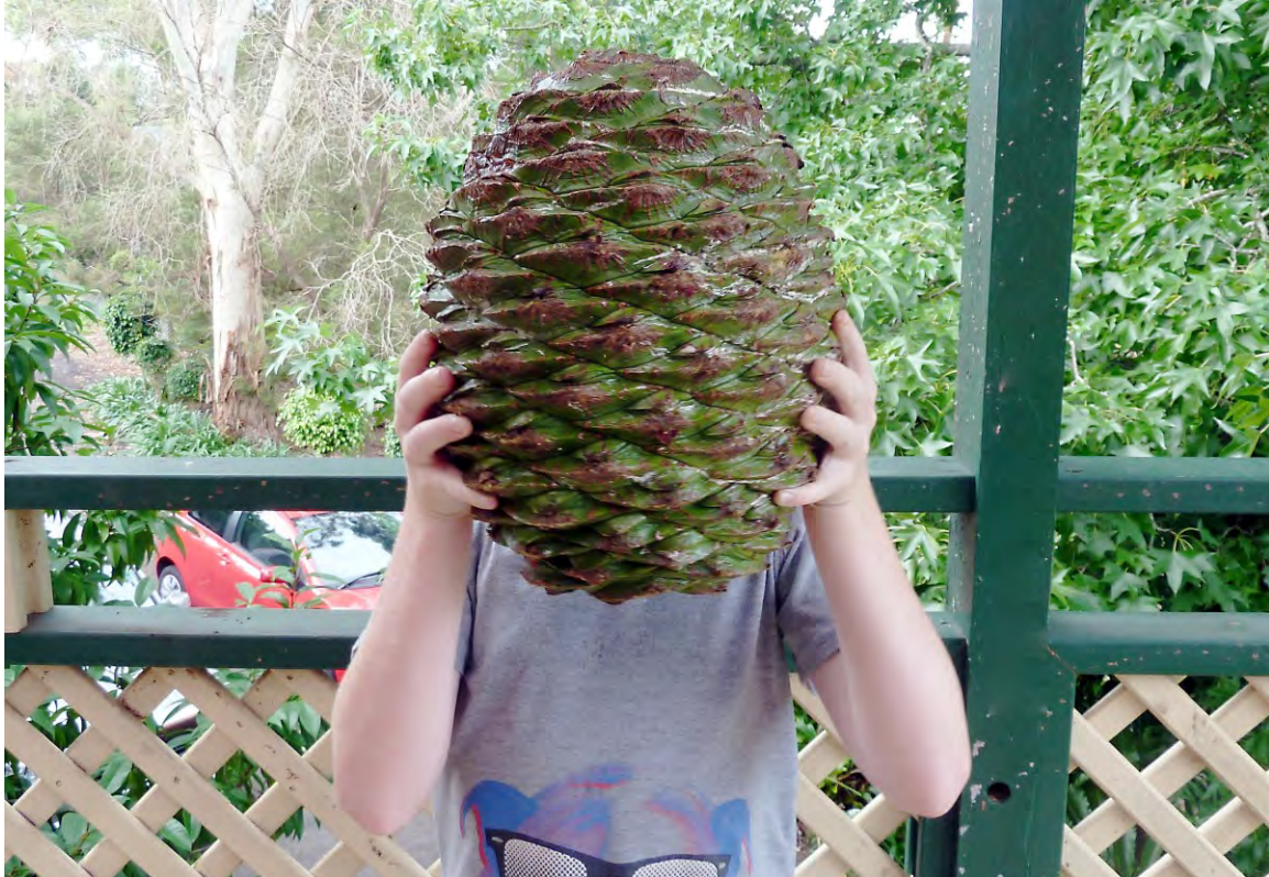
Web image showing the size of the female cone.