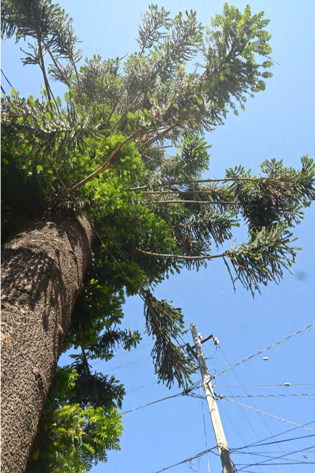
The extended branches have the characteristic leaf whorl at the end of the branches.

The sharp leaves of the tree constantly drop.